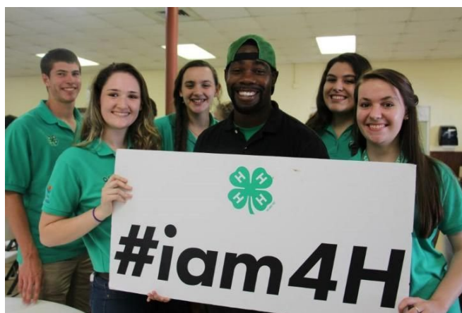
Figure 10.