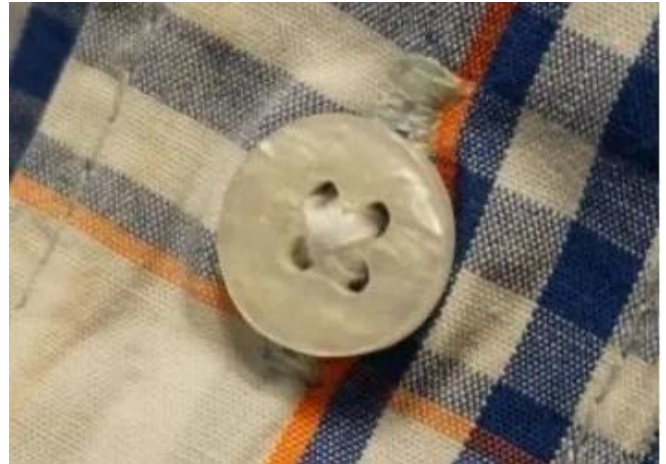
Figure 6. With a flat four-hole button, thread will form an “x” on top of the button.

Similarly, this process requires threading the needle and starting on the backside of the fabric. In contrast, you will thread the needle through one hole of the button, diagonally through another hole of the button, and back to the inside of the fabric. Repeat this going through the opposite set of holes, creating an “X” on top of the button. Stitch through the holes a few more times in a cross pattern. As a result, most four-hole buttons are sewn with the cross pattern, but you could also sew it going across or down, so you have two bars. This is just a personal preference. If you have a strong thread and enough stitches, it will hold just as well. Don’t forget to use a toothpick or needle to create the thread shank for your button. Knot the thread off in the same manner as the two-hole button.