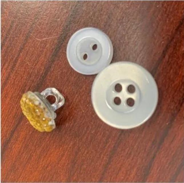
Figure 3. The button on the bottom left is a shank button. The other two are flat buttons, one a two-hole flat button and the other a four-hole flat button.

Shank buttons have what is referred to as a shank. A shank is a spacing of either thread or button material that allows spacing for the fabric that will be buttoned together. Hence, the purpose of a button shank is to raise the button above and through the hole so that it sits above the buttonhole. Shank buttons can only be sewn by hand onto garments.