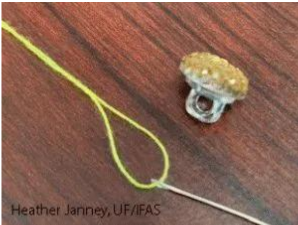
Figure 7. A shank button.