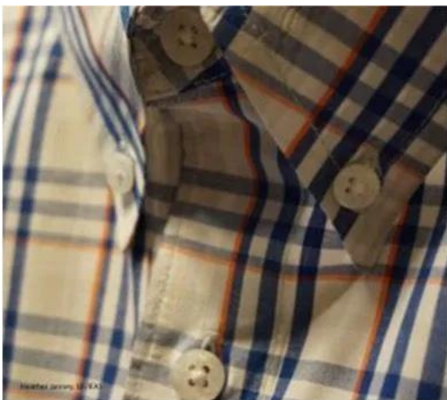
Figure 1. Buttons are included on many garments regardless of the trends or current styles.

Knowing how to sew on a button comes in handy when you are trying to put on a shirt and suddenly, a button comes loose! Losing a button can make you late, aggravate you, or require that you change clothes. Even though sewing a button back on is quite a simple task, many people refuse to try simply because it seems too hard. They throw away or donate the clothes, buttons missing and all. This publication will help you understand the difference in button types and share methods of sewing a button on.