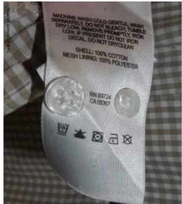
Figure 2. Extra buttons for a garment may be found sewn onto a tag within the garment.

You almost always have extra buttons hidden when you buy a garment. They might be sewn on to a tag inside the shirt or even in a plastic bag alongside the price tag.