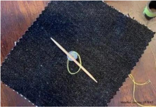
Figure 5. Placing a toothpick atop your button will allow for enough thread to create a shank. This allows for spacing when using a buttonhole.