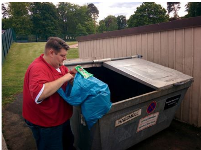
Figure 2. Data collection comes in many forms.

Reconnaissance. There are two parts to this step, fact-finding and analysis. In this step, the researcher gathers information about the idea targeted in step one. This can be done through interviews, observations, looking over other “artifacts” (newsletters, user manuals, etc.) to gather data for analysis. Once gathered, the data is analyzed for details of the “idea” and to develop informed suggestions on how to tackle the problem.