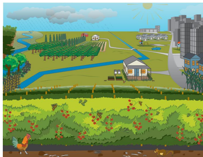
Figure 1. This agroecosystem diagram depicts how agricultural land is often located between and within natural and urban land. These surrounding areas influence resource availability, biological diversity, and ecosystem services.

Agroecosystems are ecosystems managed for production of food, fuel, fiber, or medicines. These ecosystems include the interconnected components of agriculture and nature (Figure 1). Agroecosystems are dynamic across space and time, influenced by external features of the neighboring area and connected systems.