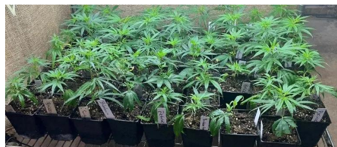
Figure 1. Propagated female hemp clones to be transplanted for outdoor production.

The purpose of this document is to provide a framework and provisional values to estimate costs and returns of hemp flower production for commercial producers in Florida. The primary objective for hemp flower producers is to consider the infrastructure, labor, and input costs associated with a hemp cropping system for flower production related to the potential returns from sales of cannabidiol (CBD) oil. CBD is currently the most popular cannabinoid for hemp. CBD is a non-psychoactive compound demonstrated to treat epilepsy, muscle spasms, and pain perception (World Health Organization 2018). Hemp-derived cannabinoid extracts and CBD isolate are currently sold in tinctures, creams, oils, capsules, foods, beverages, patches, and vapes. According to the World Health Organization (2018), "There is no evidence of public health related problems associated with the use of pure CBD."