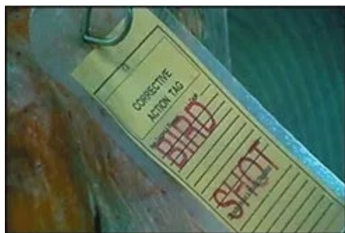
Figure 6. Lead is considered an adulterant by the Food and Drug Administration. If shot is detected on the slaughter floor, the entire carcass is routinely condemned.

Cattle producers tend to point their fingers at hunters. However, there are producers that sometimes use shotguns to gather unruly cattle. Regardless of who is at fault, this defect should be prevented with education about the consequences. Other means of animal control and capture must be used. To ensure that foreign objects are not found in carcasses, adhere to the following guidelines on the next page.