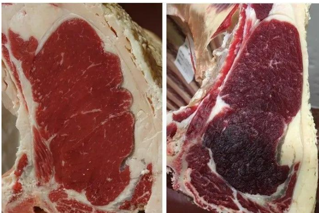
Figure 2. Variation in color of exposed ribeye. Ideally, beef is bright cherry red (left), whereas dark cutting beef (right) appears dark red to dark purplish-red.