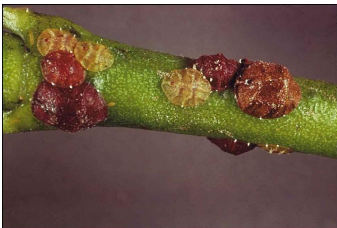
Figure 9. Caribbean black scale (various stages).

The female is 3 to 5 mm long and brown to black in color. When mature it has a very tough shell which is nearly circular or hemispherical in shape (Fig. 9). Ridges along the outer scale body form an "H" pattern. Immature scales have a lighter scale covering and lack the "H" in the early instars. Adult males are free flying. Crawlers are about 0.34 mm long and are light brown. Scales are found on young fruit stems and twigs. Caribbean black scales secrete prolific amounts of honeydew onto the stems and fruit, which later develops sooty mold that will lower fruit grade, if not washed off. A wasp, Scutellista cyanea (Motscholsky), is an egg predator that provides acceptable biological control. When inspecting mature scale for parasitism, one will frequently notice a circular emergence hole in the scale covering caused by the wasp.