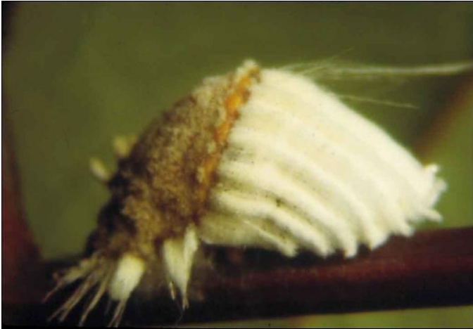
Figure 10. Cottonycushion scale.

Populations are highest in the drier months of fall and winter. The ladybeetle, Rodolia cardinalis (Mulsant), both as larvae and adults, is the main predator of the cottony cushion scale.