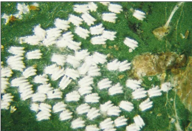
Figure 4. Fern scale.

Scale bodies of the males are white, elongated and about 1.5 to 2.25 mm long whereas the females are brown (Fig. 4). Colonies normally consist of one or two females and up to 30 males. They are found on leaves and fruit of citrus but not on large limbs or trunks. This scale has a wide host range and is found throughout Florida, but never causes economic damage to citrus.