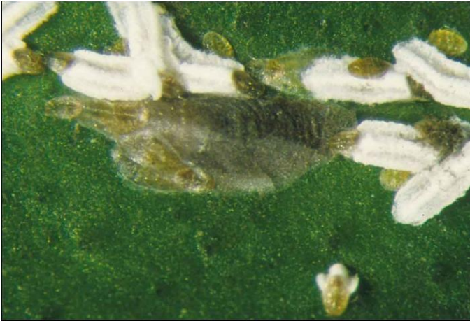
Figure 5. Snow scale, male and females.

Predators commonly found attacking other armored scales have also been found feeding on citrus snow scale. Native and introduced strains of Aphytis lingnanensis Compere and Encarsia spp. are common biological control agents.