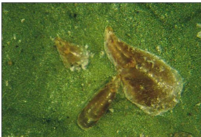
Figure 1. Purple scale.

The armor of the adult female scale is 2 to 3 mm long, purple to dark brown, elongated, and usually curved (Fig. 1). The armor of the male is much shorter and more slender than the female. The eggs are found under the scale cover and after hatching, the pearl white crawlers are less than 0.25 mm in length. Infestations may occur at any time, but are usually highest during the spring. Purple scales prefer a tree with a dense canopy and are found on leaves, twigs, and fruit. In most cases chemical control is not required as biological control by a parasitic wasp, Aphytis lepidosaphes Compere and the ladybeetle, Chilocorus stigma Say, provide adequate control. Other predators and parasitic fungi have also been found attacking the purple scales in Florida.