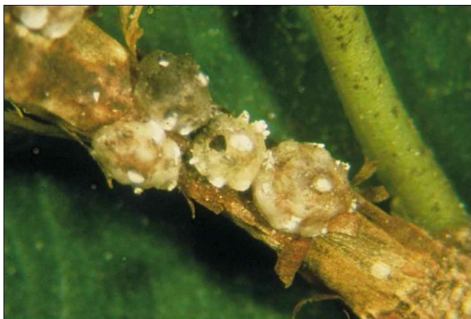
Figure 12. Florida wax scale.

The adult female is covered with a thick layer of soft wax, about 2 to 4 mm in length and 1 to 3.5 mm in width. Males are unknown in this species. Florida wax scale is highly convex, somewhat angular, and oval. The color is white, sometimes with a pinkish cast, becoming dirty white with age (Fig 12). Eggs are pink to dark red and are found under the scale's wax covering. Crawlers are pink, migrate away from under the female's wax covering, settle, and begin to extract sap from leaves or twigs. Young scales have a similar wax covering. Large amounts of honeydew are secreted by this species. Immature stages of Florida wax scales are found on the leaves and twigs with older stages frequently found on twigs and branches. Leaf populations are aligned with the leaf midrib. Florida wax scales are seldom found in large numbers due to presence of effective natural enemies.