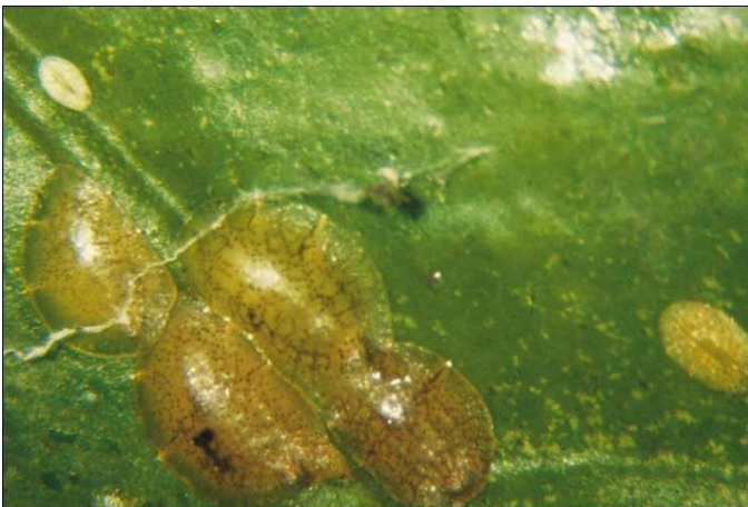
Figure 11. Soft brown scale.

The scale is heavily parasitized by several different species of parasitic wasps.