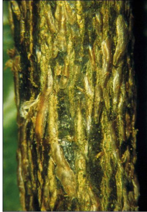
Figure 3. Glover scales on bark.