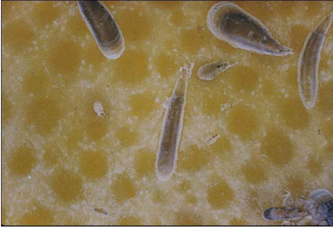
Figure 2. Glover scale, upper right corner contains a purple scale for comparison.

Glover scale is sometimes referred to as long scale. The scale covering is brown, elongated, narrow in width and about 3 mm in length (Fig. 2). The glover scale is similar to the purple scale and can be found in mixed populations. Glover scales infest leaves, twigs, woody bark, and fruit. When found on woody bark, they orient with the grain of the bark and parallel to one another and are frequently difficult to detect (Fig. 3). Glover scales are usually kept under biological control by Aphytis parasitic wasps.