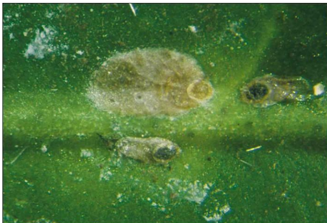
Figure 8. Chaff scale.

The scale covering is irregularly rounded to oblong, 1 to 1.75 mm in length, and very flat (Fig. 8). It conforms to the shape of the area where it begins development and will develop successive layers resembling grain chaff. The color is brownish to grayish. The female body, eggs, and crawlers are purple in color. Immature and male scales resemble the female but are smaller in size. Chaff scale is found on bark, leaves, and fruit. When fruit is infested, the areas around the scale remains green at maturity. Chaff scale can also be found under the calyx of the fruit. When found on the leaves, the midrib is a favored site for settling. Chaff scales are difficult to remove from the fruit surface in normal packinghouse operations. Effective biological control is provided by the parasitic wasp, Aphytis hispanicus (Mercet).