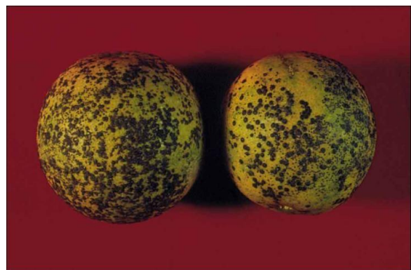
Figure 7. Florida red scale on fruit.