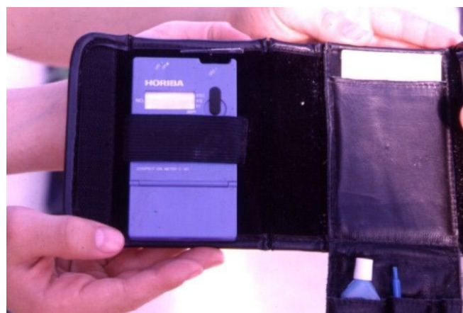
Figure 7. Ion-specific meters for measuring petiole sap nitrate and potassium concentrations.

In addition to whole-leaf tissue samples addressed above, leaf petiole sap can be analyzed for nitrate-N and K concentrations (Figure 7). Sap analyses are quick and easy and very helpful in spot-checking plant nutrient status. Methods for petiole sap analyses are available in Fla. Coop. Ext. Circ. 1144 "Plant Petiole Sap-Testing for Vegetable Crops." The critical ranges for greenhouse tomato petiole nitrate-N and K concentrations are presented in Table 9.