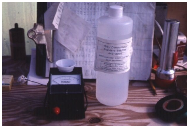
Figure 6. Conductivity meter and standard solution for routine calibration of meter.

One common, quick and easy (but fault-prone) method is to measure the soluble salt or electrical conductance (EC) level. Conductivity meters are used for this, and the measurement is easy and fast (Figure 6). However, this procedure only tells the grower the relative amount of total "salts" in the solution, and it tells the person nothing about each specific nutrient in the solution.