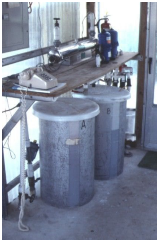
Figure 3. Fertilizer stock tanks for rockwool or perlite systems located under proportioner bench.

In most production systems, at least two stock tanks are needed (Figure 3). This is because certain fertilizer sources when mixed together in concentrated form will lead to insoluble precipitates. The most common of these are calcium phosphate (from mixing calcium nitrate and phosphorus materials) and calcium sulfate (from mixing calcium nitrate and magnesium sulfate). Most production situations can get by with two stocks: one contains potassium nitrate, calcium nitrate, and iron chelate, and the other contains the phosphorus source, magnesium sulfate, micronutrients, and potassium chloride, or might contain some of the potassium nitrate as well (Figure 4).