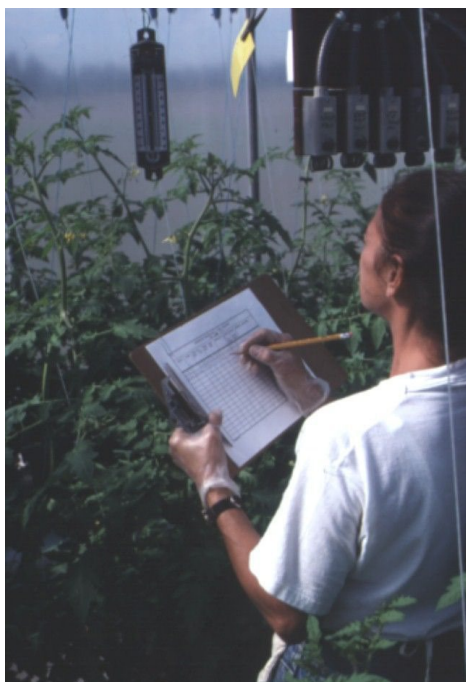
Figure 5. Accurate records on electrical conductivity, pH, and amounts of nutrient solution applied are important for efficient fertilizer management.

Accurate calculations of the amounts of fertilizer materials to dissolve to achieve the desired concentrations of individual nutrients in the final growth nutrient solution are critical to the success of a fertilizer program (Figure 5).