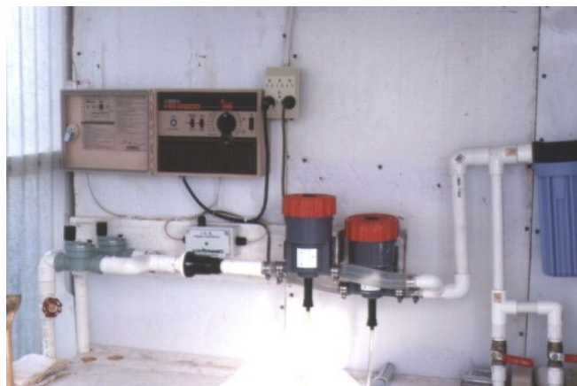
Figure 4. Irrigation controller, solenoid valves, pressure regulator, and proportioners for rockwool or perlite systems.

Once the small batches are added to the stock, the total volume of the stock tank is brought to the desired level and stirred. After the stocks have settled for a while (a few hours), the solution will become clear, but a sludge will often form in the bottom of the calcium/potassium nitrate tank. This sludge is from certain additives in some fertilizer materials to prevent caking and dust. These materials are not soluble and will settle to the bottom of the tank. Therefore, the stock tanks will need to be rinsed periodically to remove this sludge. This problem can be alleviated by using technical grade fertilizer salts or clear (decanted) fertilizer solutions, such as liquid calcium nitrate.