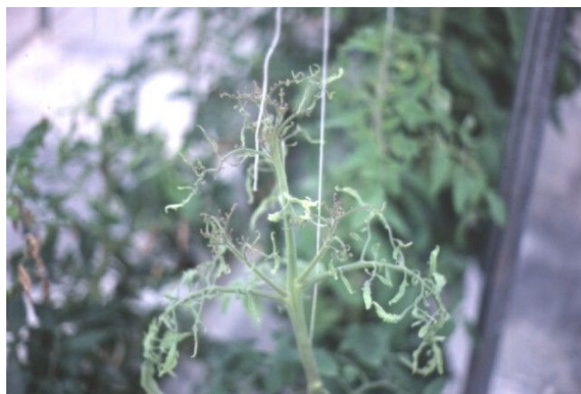
Figure 1. Foliar symptoms of severe calcium deficiency on tomato.

Calcium is immobile in the plant; therefore, deficiency symptoms show up first on new growth (Figure 1). Deficiencies of Ca cause necrosis of the new leaves or lead to curled, contorted growth. Examples of this are tip burn of lettuce and cole crops. Blossom-end-rot of tomato also is a calcium-deficiency related disorder (Figure 2). Cells of the tomato fruit deprived of Ca break down causing the well-recognized dark area on the tomato fruit blossom-end. Sometimes this breakdown can occur just inside the skin so that small darkened hard spots form on the inside of the tomato while the outside appears normal. Sometimes the lesion on the outside of the fruit can be sunken or simply consist of darkening of the tissue around the blossom area.