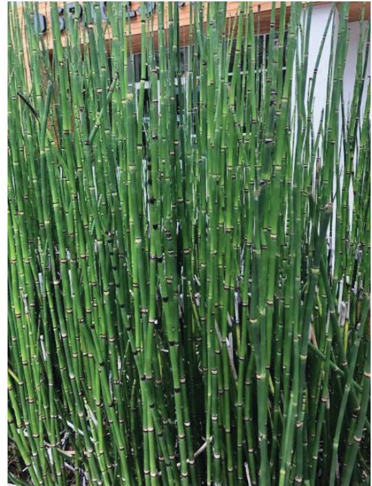
Figure 11. Foliage detail for scouring horsetail showing segmented leaves.