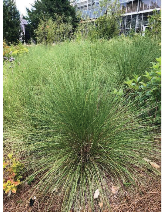
Figure 7. Muhly grass showing summer appearance of clumping growth form.

become a more dominant element. Tall grasses with distinct vertical lines may also be used to accentuate the lines of the landscape, as with the evergreen foliage of the grass-like scouring horsetail ( Equisetum hyemale ) (Figures 10 and 11). During the fall months, when little else is flowering or drawing attention, a grass like ‘Burgundy Giant’ fountain grass ( Pennisetum × ‘Burgundy Giant’) with its burgundy foliage and rose purple flowers will take center stage.