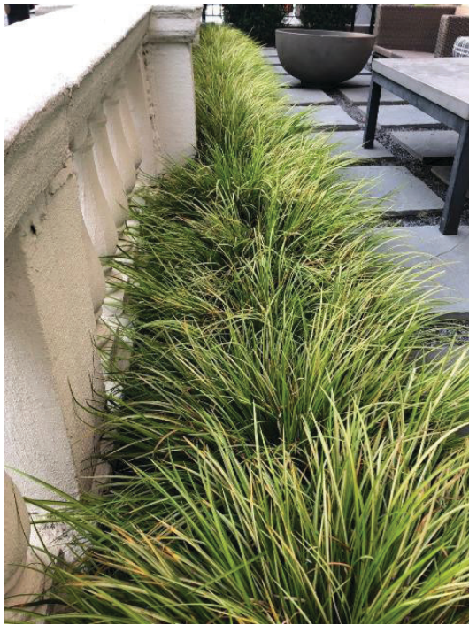
Figure 5. Sweetflag ( Acorus ) used as an accent in a narrow planting bed to soften the transition between a patio and decorative wall