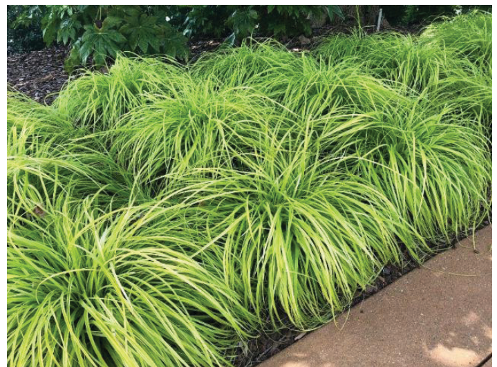
Figure 8. Evercolor Sedge showing massing as a ground cover.