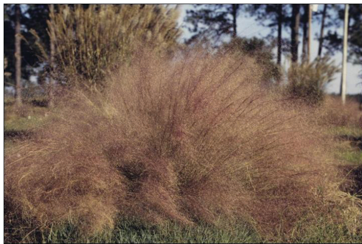
Figure 6. Muhly grass showing pink/purple appearance of stamens in inflorescences.