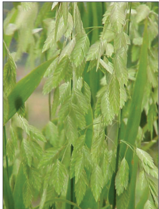
Figure 2. Mountain oats seedheads.