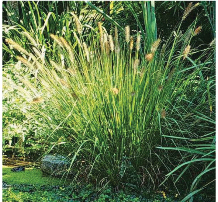
Figure 3. 'Hameln' fountain grass. Credits: Mack Thetford, UF/IFAS

Other medium grass selections include muhly grass ( Muhlenbergia capillaris ) (Figures 6 and 7) and Evercolor Sedge ( Carex oshimensis 'Everillo') (Figure 8), which may be used in mass plantings or as ground cover, and leather leaf sedge ( Carex buchananii ), which can be used as an accent plant within plantings of annuals such as wax begonia.