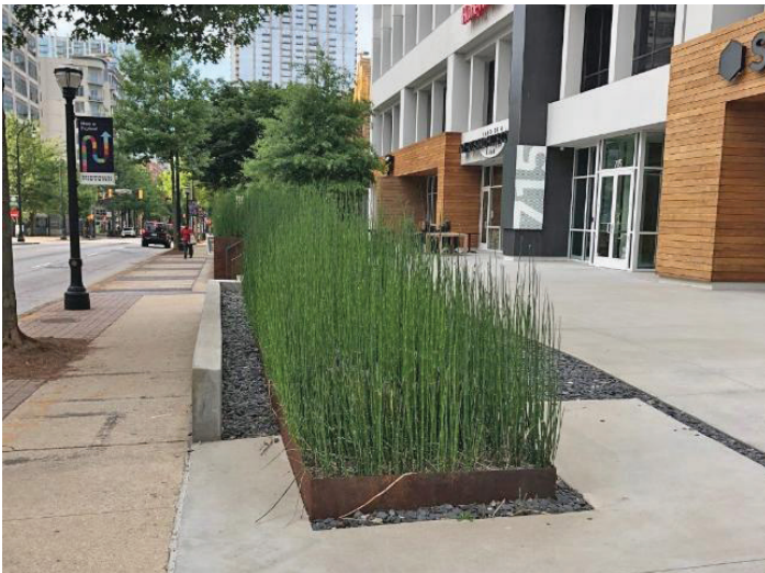
Figure 10. Scouring horsetail in a planter.