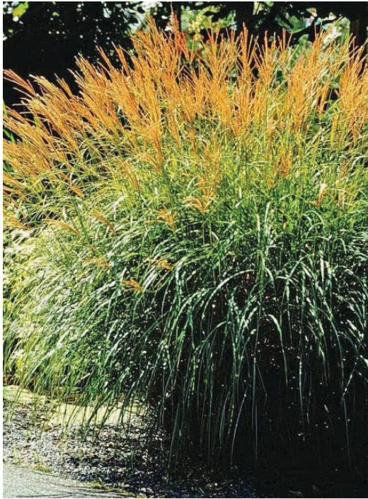
Figure 9. 'Arabesque' silver grass.