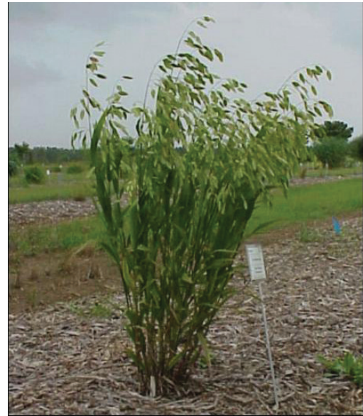
Figure 1. Mountain oats.

slowly increasing over time. Mountain oats ( Chasmanthium latifolium ) is an example of a clump-forming grass (Figures 1 and 2). Creeping grasses, also called running or spreading grasses, spread by aboveground stems, called stolons, or underground stems, called rhizomes. Grasses that spread by stolons or rhizomes form roots along these stems, making many of them difficult to maintain within a confined area. Be sure to select the growth form best suited to your garden site.