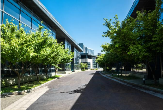
Figure 3. Plant small-stature trees if shade is desired near buildings. Canopies catch the wind, and trees can blow over when they grow substantially above the roof line.

several small-stature trees to create a closed canopy (Figure 3).