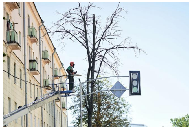
Figure 6. Upright trees usually require less pruning to keep branches clear of traffic, but they typically need regular pruning to develop wind-resistant structure.

Tree forms can have a big impact on tree maintenance requirements. There are many urban landscape situations that call for trees near the pavement. Small, spreading trees that are multi-trunked require regular pruning if they are planted too close to a sidewalk, whereas a small, upright tree or a larger tree can be trained to grow over the walk or street (Figure 6). Trees with a pyramidal form usually require less pruning to develop strong, wind-resistant branch structure than those with other forms. Trees with rounded, oval, or spreading canopies often need periodic pruning in the first 25 years after planting to ensure good structure and to provide clearance.