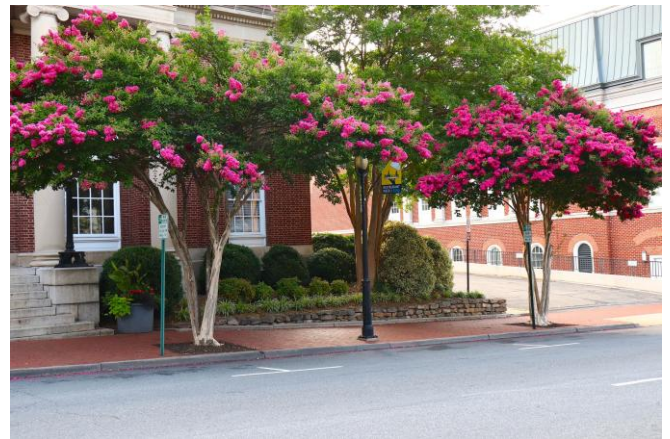
Figure 4 . Small-maturing trees should be planted where soil space is limited to keep them healthy and stable in winds, and to prevent damage to surrounding structures.

Match ultimate tree size to the soil volume available for root growth. This strategy helps keep trees healthy and stable in storms. It also prevents damage to surrounding sidewalks, curbs and pavement (Figure 4). Soil under pavement is typically poorly aerated and compacted, a situation that is considered inhospitable for roots, unless soil is coarse sand and well drained. Roots will be mostly confined to soil space not covered by pavement or the space between the soil and bottom of the pavement. This will inhibit development of a strong root system and can result in the tree becoming unstable in hurricanes. Some wet-site-tolerant trees (e.g., baldcypress) are adapted to produce roots under pavement, and they can remain upright in strong winds.