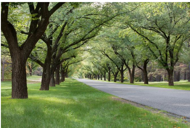
Figure 1. Proper planning can produce successful canopied streets and a healthy urban forest when enough growing space and soil is available.

Proper site evaluation, planning, and execution can result in a successful urban forest that resists hurricanes. Figure 1 shows a successful canopy street. Trees such as live oak trees can be chosen for their wind-resistant structure and ability to provide shade, but they were only able to thrive given the adequate open soil and growing space and distance from above-ground structures, such as streetlights and wires.