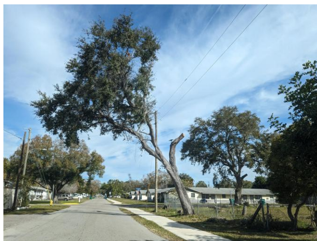
Figure 2. Trees located under wires are costly to maintain and can bring down the wires in strong winds. Some communities plant large trees under wires and must prune to keep them clear of wires.