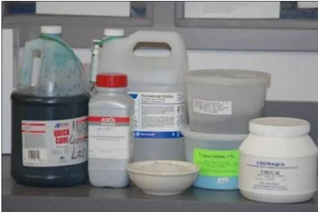
Figure 1. Treatment chemicals.

Some chemicals (e.g., potassium permanganate, formalin) may damage fish gills or skin and should be used carefully and only when absolutely necessary. Chemicals may also adversely affect water quality. For example, formalin decreases dissolved oxygen concentrations in water. Ideally, the producer should be familiar with common health problems, actively work to identify and treat them as they become apparent and seek assistance from a fish health professional when needed.