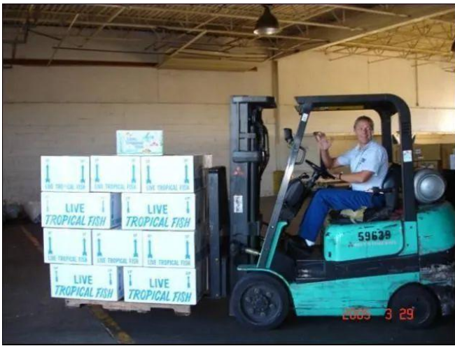
Figure 5. Moving fish with a fork-lift at the airport between planes.