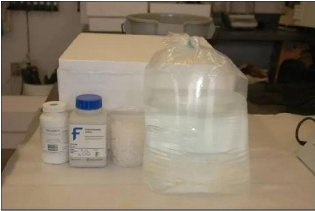
Figure 2. Shipping additives [tricaine methanesulfonate, sodium thiosulfate, salt (NaCl)] and supplies.

Chemical additives are often used in transport water to sedate the fish or reduce pathogen (any agent that causes disease) loads in the water (Figure 2).