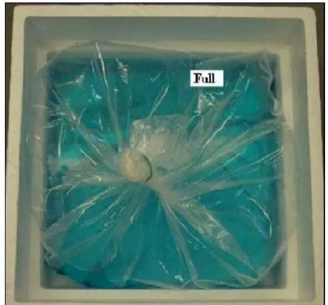
Figure 4. Full square-bottom shipping bag.

Pillow bags do not have square bottoms, so they lie on their sides. They are less expansive than square-bottom bags and come in a variety of sizes.