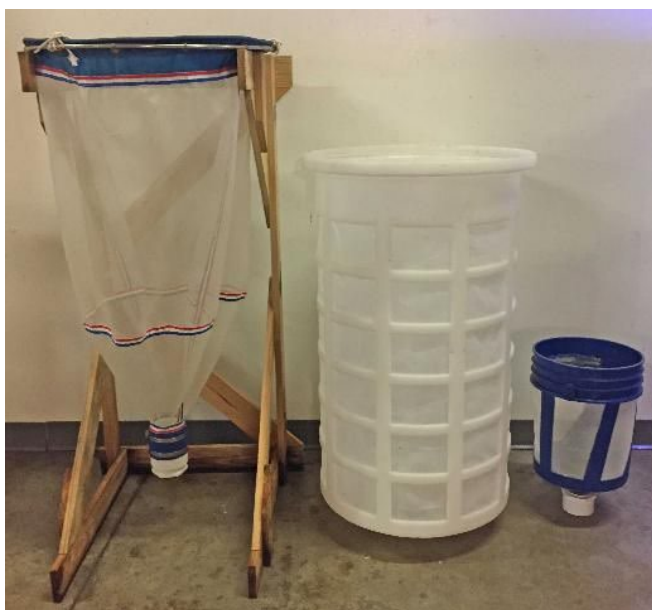
Figure 4. Alternatives to a bucket include a modified plankton tow net or a plastic barrel. These will provide greater mesh surface area and will accommodate larger spawns than a bucket.

Aquaculture systems can have overflows that lead directly to a sump. A simple way to test if spawning is occurring is to place a fine mesh net between the overflow and the sump where all, or most, of the water flows. It may also be possible to increase the water level in the sump so that the bottom of the net and the