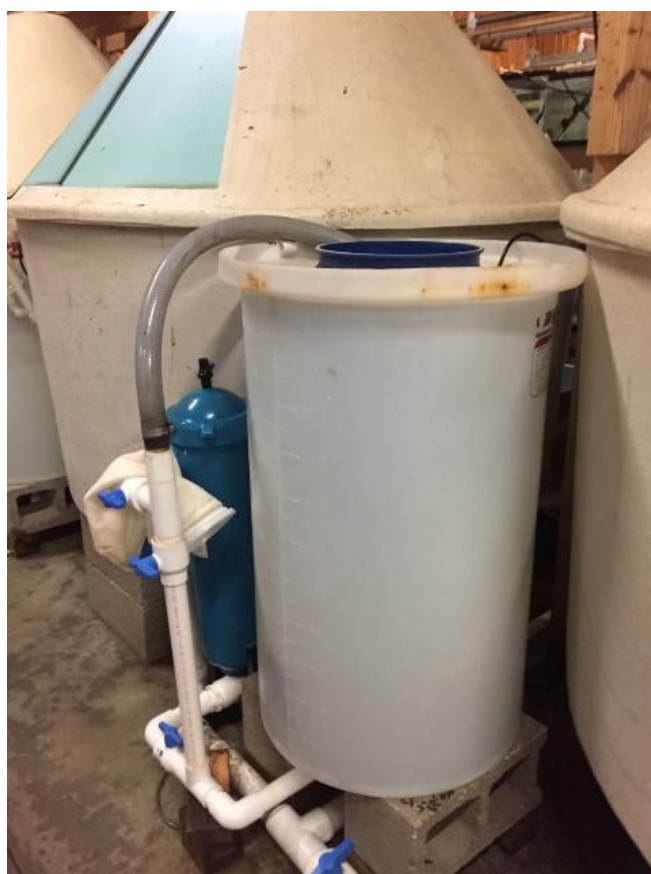
Figure 2. Culture tank (left rear) and the sump/collection tank (front center) containing an upwelling pre-filter egg collector.