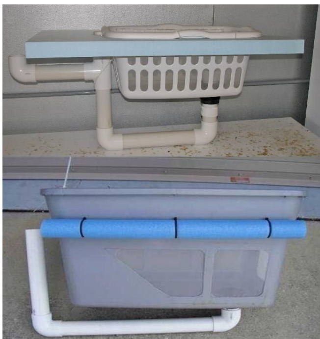
Figure 3. Photos of floating airlift egg collectors. (Top) The intake can be fine-tuned by placing a PVC pipe of appropriate lengths into the intake elbow to ensure it is ~1 cm below the water surface when it skims eggs from the surface. (Bottom) Airlift egg collector constructed of a plastic bin and flotation provided by a swimming pool noodle.