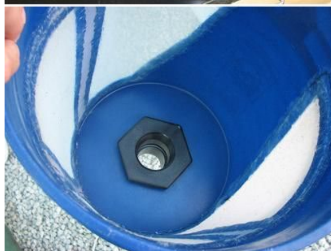
Figure 7. (Top) Five-gallon bucket with openings removed and vertical areas for nylon mesh screen attachment. (Bottom) Egg collector bucket showing attached nylon mesh screen and bulkhead for attachment to discharge pipe within the sump. If you are constructing an upwelling egg collector, attach a bulkhead to the bottom of the bucket (Figure 7). Then, attach a male PVC slip adapter to the bulkhead on the outside of the bucket, which can be slipped onto the standpipe within the sump. Use a hole-saw, a drill, or a jigsaw to remove the proper sized hole for the bulkhead. Scrape and sand smooth all the rough edges around the hole.

For all egg collectors, choose a nylon screen mesh diameter that is smaller than the egg diameter of the target species. The mesh size should be 40%–60% of the diameter of the eggs to prevent them from getting damaged in the mesh. For example, a 500 \mu\text{m} (micron) mesh would be used for an egg with an 800–1000 \mu\text{m} diameter. Attach the nylon mesh screen to the inside of the bucket as smoothly as possible with hot glue to prevent damage or entrapment of eggs. Apply the hot glue in multiple thin layers until the screen is sealed against the container walls. When gluing, ensure there