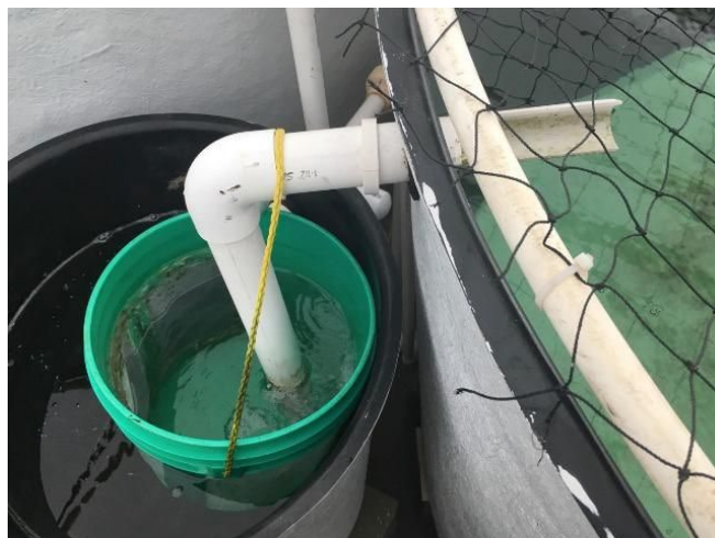
Figure 1. Overflow pre-filter egg collector with water overflowing from the skimmer pipe within the tank directly into screen-mesh-lined egg collector. Note the skimmer pipe in the tank is cut in half to collect eggs as they float toward the collector.

A common overflow egg collector used in marine fish aquaculture is pictured in Figure 1. In this design, water and buoyant eggs enter through a skimmer pipe in the culture tank and flow directly into the egg collector, which is housed inside of a collection sump. Often the skimmer pipe will have an attached PVC pipe cut in half lengthwise to form a barrier for eggs as they rotate within the circular flow of the tank's surface water. This half pipe will direct floating eggs into the skimmer pipe, which exits the tank and flows directly into the egg collector. Another option for an overflow pre-filter egg collector is a modified plankton tow net (Figure 4). This maximizes surface area of the egg collector to prevent clogging of the screen and will accommodate higher water flow rates and higher volumes of eggs spawned.