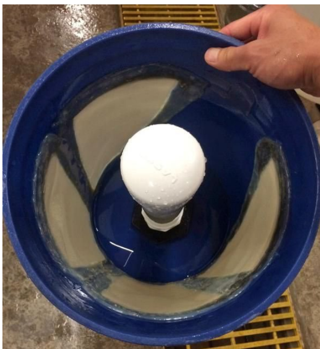
Figure 6. Upwelling pre-filter egg collector with a standpipe and cap used when removing the bucket for cleaning and egg collection. The standpipe prevents contents from exiting the bucket and entering the water flowing into the filtration system.