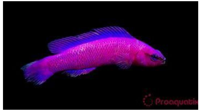
Figure 2. Orchid dottyback ( Pseudochromis fridmani ).

Mainly found in the Indo-West Pacific, dottybacks are a significantly smaller family compared to Pomacentridae (Madhu et al. 2016). They typically consume small invertebrates and are characterized by an elongated body and interrupted lateral line (Thresher 1984). Dottybacks are small, brightly colored, and hardy, making them perfect additions to any marine aquarium.