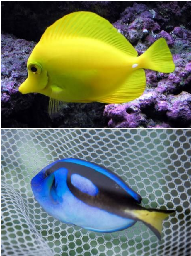
Figure 7. Yellow tang ( Zebrasoma flavescens , top), and palette surgeonfish or blue tang ( Paracanthurus hepatus , bottom).