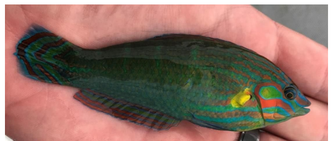
Figure 8. Tail-spot wrasse or melanurus wrasse ( Halichoeres melanurus ).