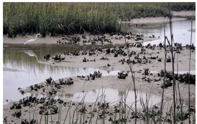
Figure 1. Oyster habitats can provide both forage and refuge for small fish while predators also use these habitats to forage for small fish.

competitive processes, like foraging and refuge-seeking, habitats can influence the intensity of density-dependent mortality. Through this process, habitat changes can alter recruitment levels and fish populations overall. In this publication, we describe ways in which habitat can alter recruitment processes, specifically with regard to oyster reefs and recent/ongoing losses of oyster habitat in Florida and beyond. Oysters have declined by about 90% globally, and while Florida oyster reefs may be in fair health, their condition has declined, exemplified by the collapse of the oyster population in Apalachicola Bay in 2012 (Beck et al. 2011; zu Ermgassen et al. 2012; Pine et al. 2015). This information should help the interested public understand the particular attention being paid to oyster preservation, conservation, and oyster reef restoration. It should also be helpful to management agency personnel and outreach professionals for use in educational efforts about habitat importance to fish populations—in particular, oyster reef habitat.