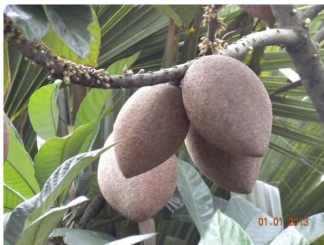
Figure 2. 'Magaña' cultivar.

growers after meeting all the supply side costs). Hence, the crop is worth upwards of $5.2 million at the farm gate level.