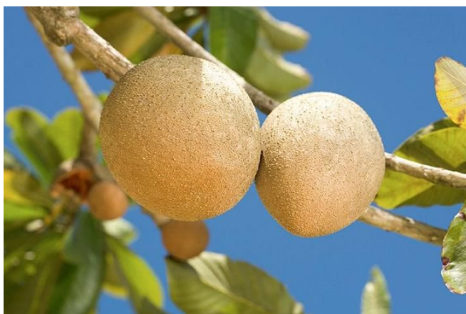
Figure 1. Mamey sapote. Credit: USDA

Mamey sapote ( Pouteria sapota ), originally from Mexico and Central America, is a tropical fruit tree cultivated in Central America, South America, and the Caribbean. It can be grown in subtropical conditions, but it is sensitive to freezing temperatures. The fruit was first reported in Florida by Pliny Reasoner in 1887. After several introductions from the Caribbean during the early twentieth century and an influx of Cuban Americans to Florida, a small but vibrant mamey sapote industry began in the mid-1970s in south Florida (Morton 1987; Pantin 1991). Commercial production of mamey sapote in the United States is limited to south Florida, mainly Miami-Dade County. The United States also imports a limited amount of fruit from Puerto Rico, with the main destination being the Boston market.