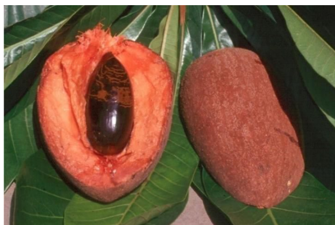
Figure 3. 'Pantin' cultivar.

There is little information on the production costs and returns of minor tropical fruit crops, so our objective is to provide an estimate of the costs and returns associated with an established mamey sapote orchard in south Florida. Our information was obtained from field interviews with industry experts and with growers