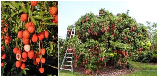
Figure 1. 'Mauritius' lychee at harvest and 'Brewster' lychee.