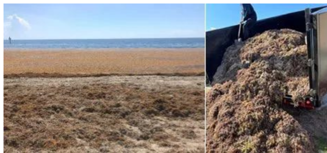
Figure 1. Sargassum spp.

This publication examines the costs that the city of Ft. Lauderdale incurred to establish a sargassum compost facility. The objective of this analysis is to provide insights to other municipalities and small businesses around south Florida who are considering starting similar composting operations with the expectation that sargassum composting will provide them with more space in their landfills while maintaining their beaches' tourist appeal. The data for this analysis were collected through interviews in 2021 with several individuals in municipalities and small businesses, which use a wide range of sargassum management strategies. We found that Ft. Lauderdale saves at least $326,000 annually by operating its own composting facility.