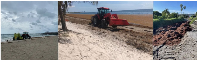
Figure 2. Left, Sargassum spp. collection on Miami Beach, Florida, with a surf rake; middle, Sargassum spp. collection at Key Biscayne; right, Sargassum spp. compost at the Ft. Lauderdale compost facility.

park where it is dried and placed into a compost pile (Figure 2, right). Once dried, the Sargassum spp. is then passed through a shaker to remove any debris before it is used as compost by the city or given away to city residents.