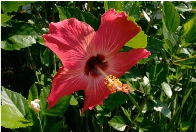
Figure 1 Hibiscus blossom..