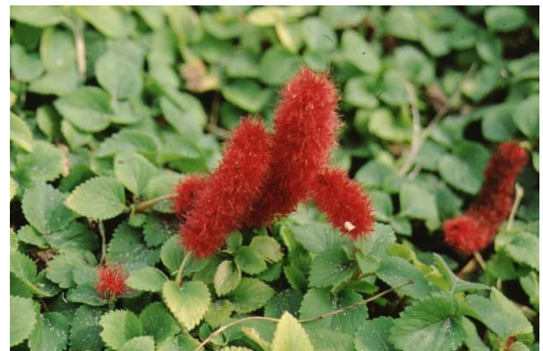
Figure 3. Flower— Acalypha herzogiana : dwarf chenille plant.