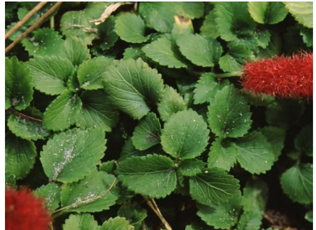
Figure 2. Leaf— Acalypha herzogiana : dwarf chenille plant.