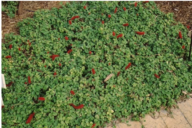
Figure 1. Full form— Acalypha herzogiana : dwarf chenille plant.

Dwarf chenille plant is a perennial groundcover that reaches a maximum height of 6 inches (Figure 1). This plant is a fine-textured relative of the more commonly used chenille plant, Acalypha hispida , which is an upright shrub. In the full sun, this plant forms a thick canopy of tiny, serrated leaves 3/4 inches long by 1/2 inches wide (Figure 2). Bright red, fuzzy flowers stand upright above the foliage (Figure 3).