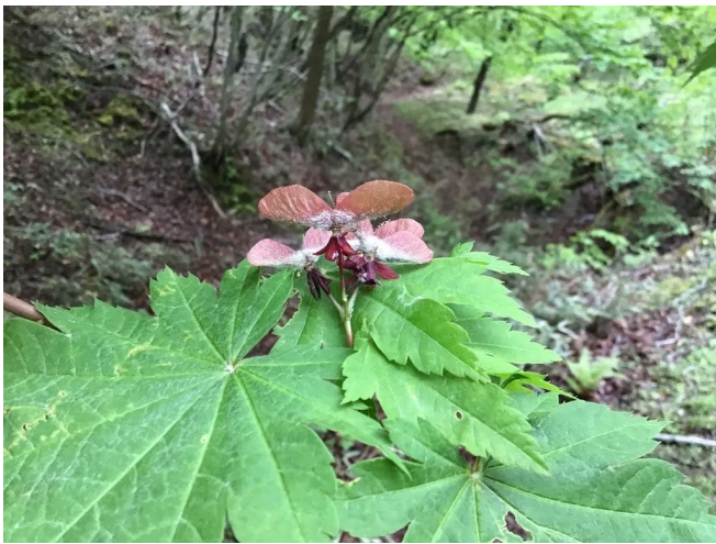
Figure 4. Fruit— Acer japonicum : fullmoon maple.