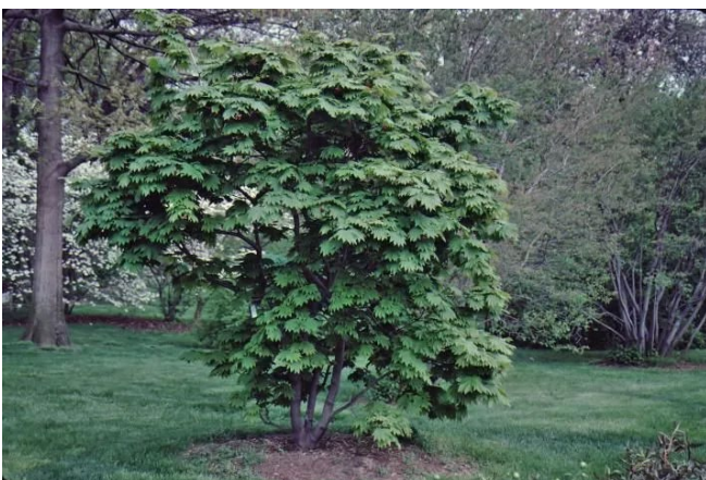
Figure 1. Full form— Acer japonicum 'Vitifolium': 'Vitifolium' fullmoon maple.