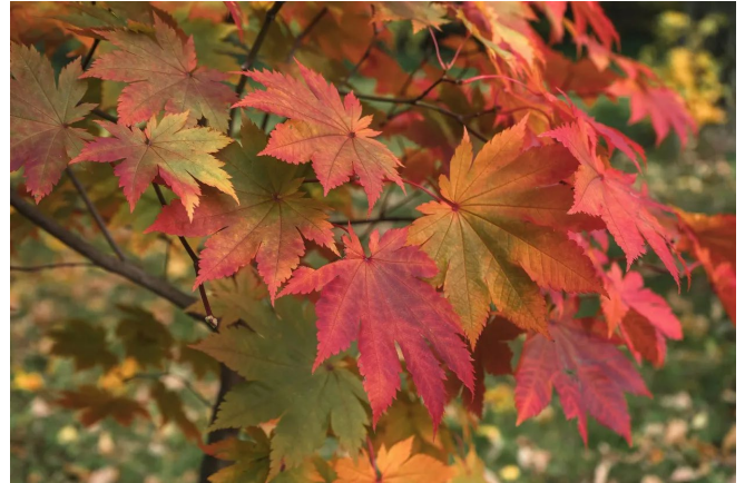
Figure 2. Leaf, fall color— Acer japonicum : fullmoon maple.

Fullmoon maple is a small deciduous tree or large shrub that can reach between 10 to 30 feet in height and width, depending on cultivar selection (Figure 1). Fullmoon maple has a smooth, rounded canopy that fits well into a Japanese garden, due to its exotic silhouette. The deeply divided, soft green leaves have 9 to 11 lobes and are delicately displayed on thin, drooping branches. This plant receives its common name from the way in which the palmately lobed leaves are rounded, resembling the full moon. This plant's foliage takes on exceptional yellow to red fall coloration (coloration varies between cultivars), making this small, dense plant stand out in the landscape (Figure 2). The hanging clusters of showy purple to red flowers appear in late spring, and are followed by the production of winged seeds, called samaras (Figures 3 and 4). The flowers of Acer japonicum are showy compared to those of other maple ( Acer ) species. Many cultivars of this species exist, with variation in growth sizes, forms, and coloration of foliage.