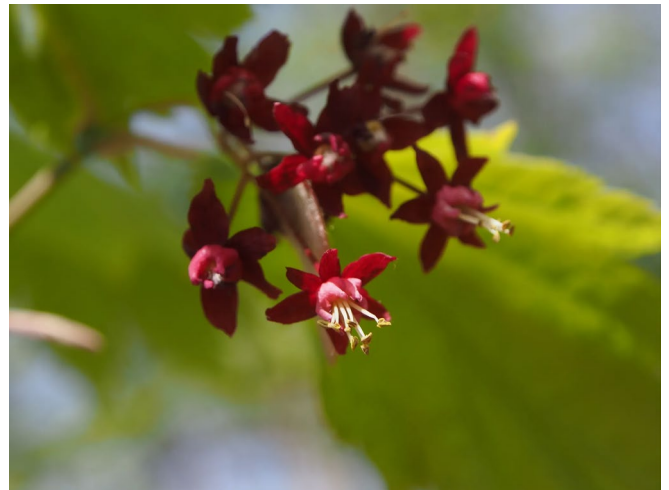
Figure 3. Flower— Acer japonicum : fullmoon maple.