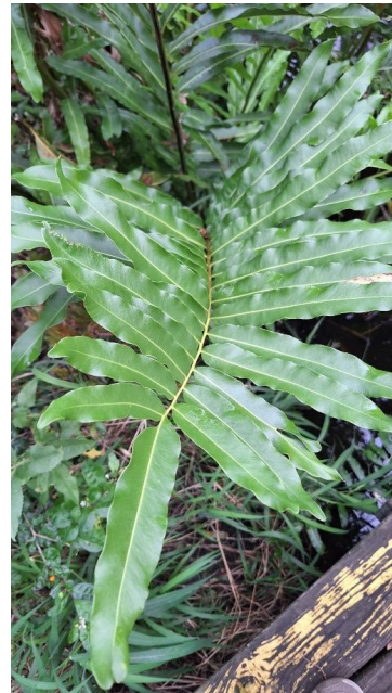
Figure 2. Leaf— Acrostichum danaeifolium : leather fern frond.

Leather fern is an herbaceous perennial plant, native to Florida, with a height of 4 to 8 feet (Figure 1). The 3- to 6-foot-long pinnately divided fronds emerge from the ground to form a beautifully textured, open form (Figure 2). The plant changes very little throughout the year but provides an evergreen mass of attractive foliage. The underside of the fertile fronds are brown due to the presence of reproductive spores, which bring added color into the landscape (Figure 3). Leather ferns are well suited for mass plantings, accents, or borders. Leather fern is a good option for shaded, wet areas in the landscape.