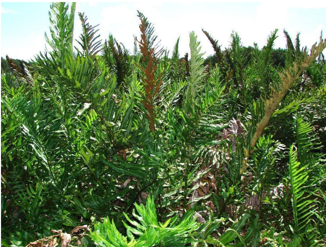
Figure 1. Full form— Acrostichum danaeifolium : leather fern mass planting.