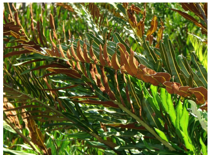
Figure 3. Leaf— Acrostichum danaeifolium : leather fern frond underside.