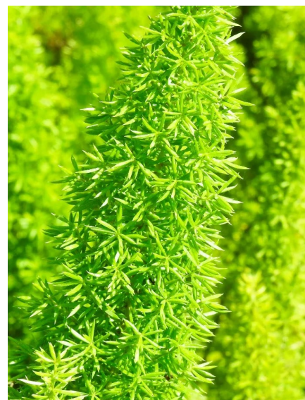
Figure 2. Leaf— Asparagus densiflorus 'Myersii': Meyers asparagus fern.