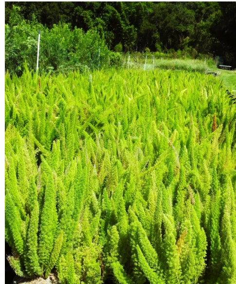
Figure 1. Full form— Asparagus densiflorus 'Myersii': Meyers asparagus fern.

Meyers asparagus fern is a spreading perennial herb that has a fine texture with a stiff, upright growth habit (Figure 1). It has a height of up to 2 feet and spread of 4 feet. The habit is quite unlike that of the more common Sprenger asparagus fern, which has a feathery texture and arching to cascading form. The structures that most consider to be the leaves of this plant are narrow, light green, leaf-like branchlets called cladophylls (Figure 2). The asparagus fern has stems that emerge directly from the ground and has very short branches. These stems are woody and are often armed with sharp spines. The flowers are inconspicuous, white or pale pink in coloration, and occur in 1/4-inch-long axillary racemes (Figure 3). This plant produces showy red berries, which attract birds (Figure 4). This plant is suited to a variety of uses including mass planting or groundcover, container or above-ground planter, as a houseplant, border in the landscape, or used as an accent.