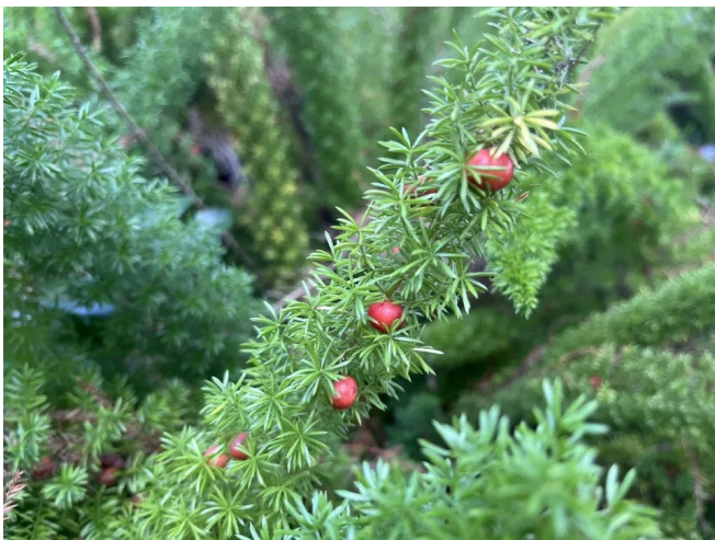
Figure 4. Fruit— Asparagus densiflorus 'Myersii': Meyers asparagus fern.