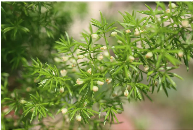
Figure 3. Flower— Asparagus densiflorus 'Myersii': Meyers asparagus fern.