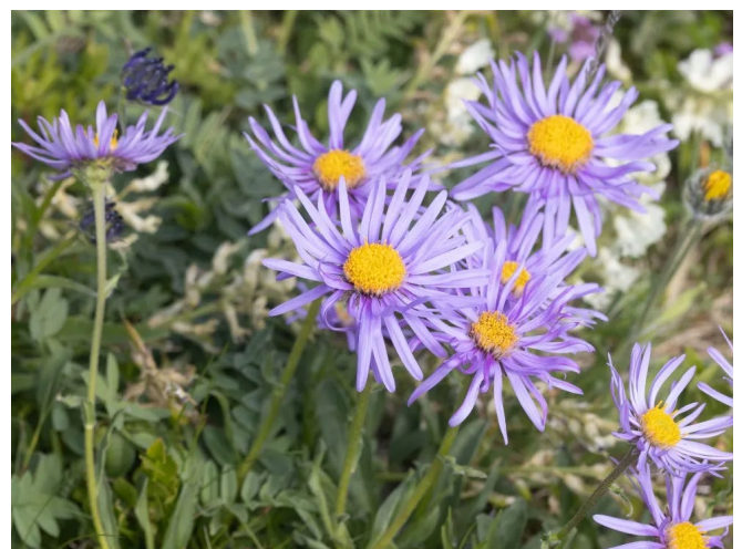
Figure 2. Flower— Aster spp.: Aster alpinus , Aster.