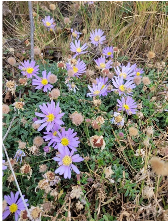
Figure 1. Flower— Aster spp.: Aster asagrayi , Aster.

Aster is a genus containing around 186 species of plants native to both Europe and Asia (North American asters belong to the genus of Symphyotrichum and Eurybia ). They are an upright, herbaceous perennial plant that may reach a height of 8 feet and spread of 4 feet, depending upon the species (Figure 1). Asters produce large flower clusters that may be white, purple, lavender, pink, and red in coloration (Figure 2). The Greek word Aster means star, describing the appearance of the flowers. Asters have 2- to 4-inch lanceolate leaves, which are deciduous (Figure 3). The plants tolerate drought conditions and poor soil; however, bloom quality will decrease in these conditions. This plant is well suited for mass plantings, use as edging in a landscape bed, to attract butterflies and other pollinators, or may be used as cut flowers in arrangements.