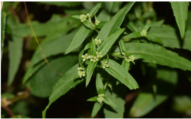
Figure 3. Leaf— Aster spp.: Aster taiwanensis , Aster .