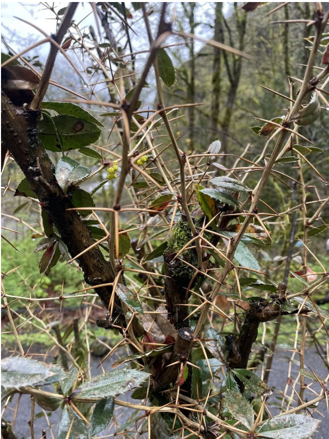
Figure 4. Stem— Berberis julianae : wintergreen barberry.