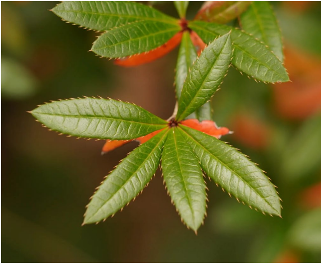
Figure 3. Leaf— Berberis julianae : wintergreen barberry.