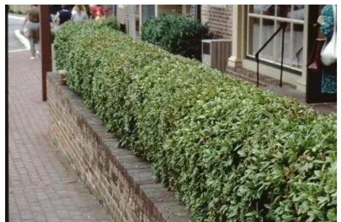
Figure 2. Full form, manicured— Berberis julianae : wintergreen barberry.