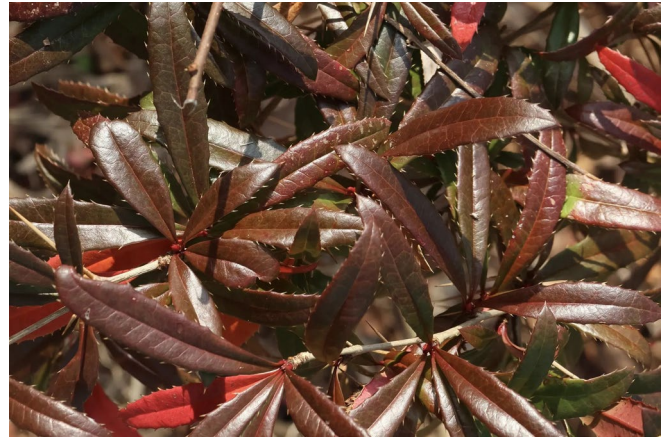
Figure 5. Leaf, fall color— Berberis julianae : wintergreen barberry.