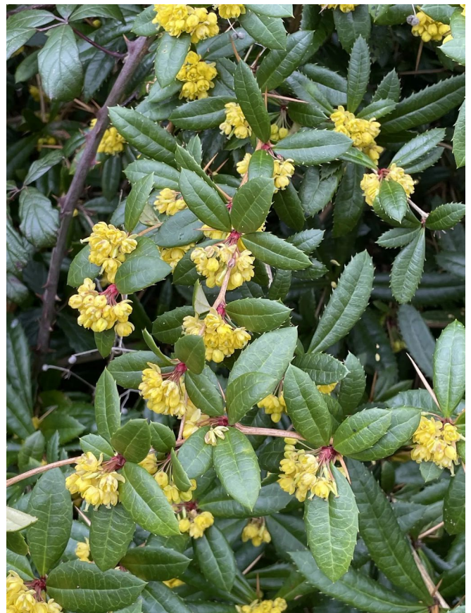
Figure 6. Flower— Berberis julianae : wintergreen barberry.