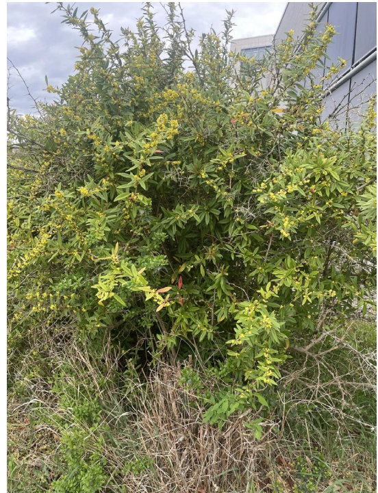
Figure 1. Full form— Berberis julianae : wintergreen barberry.

Wintergreen barberry is a rapidly growing perennial shrub that reaches a height of 10 feet and spread of 8 feet (Figures 1 and 2). It is ideal for use as an almost impenetrable hedge or barrier planting, with its dense branching growth habit, spiny leaves up to three inches long, and the three-parted spines located along the stiff stems (Figures 3 and 4). It is also one of the hardiest evergreen barberries. The leaves of wintergreen barberry may turn wine-red or purplish-bronze in the winter (Figure 5). Clusters of small, lemon-yellow blooms appear in late spring for 1 to 2 weeks and may occasionally have an unpleasant fragrance (Figure 6). Clusters of blue-black berries follow the flowers and persist on the plant (Figure 7). Fairly upright but more rounded with age, wintergreen barberry also works well in mixed shrubbery borders or as a foundation planting. Grouping three plants together in a shrubbery border makes for a nice contrasting textural effect.