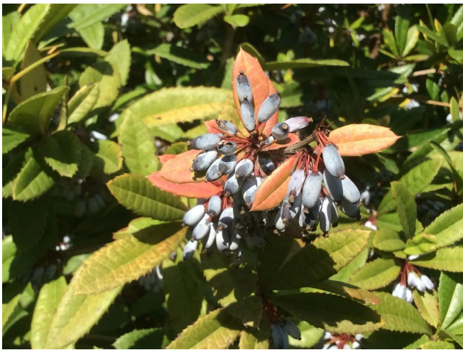
Figure 7. Fruit— Berberis julianae : wintergreen barberry.