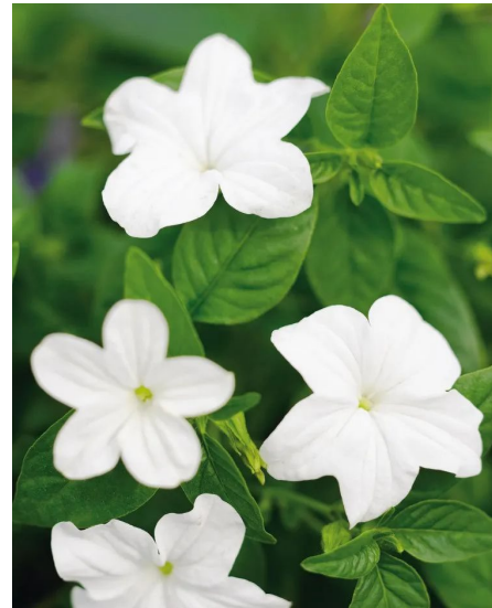
Figure 2. Flower— Browallia speciosa 'Endless™ Flirtation': amethyst flower hybrid.