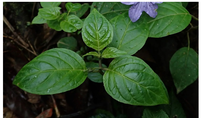
Figure 3. Leaf— Browallia speciosa : amethyst flower.