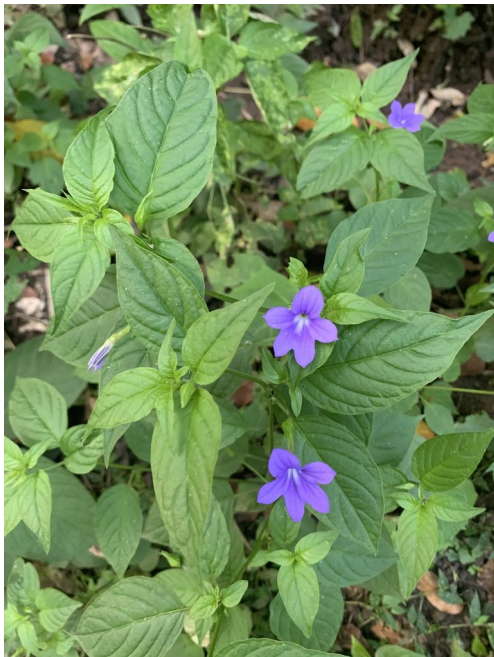
Figure 1. Full form— Browallia speciosa : amethyst flower.

Browallia ( Browallia speciosa ) is a warm season perennial that is generally grown as an annual. It has a rounded growth form and reaches a height and spread up to 2 feet (Figure 1). It is notable for its showy purplish-blue flowers (certain cultivars display white flowers), which bloom from spring through fall (Figure 2). The leaves are ovate and are between 2 and 4 inches long (Figure 3). Browallia is well suited for containers, planted en masse, or may be used as cut flowers. Cultivars with a variety of growth habits and flower coloration are available in the horticultural trade.