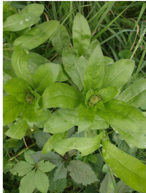
Figure 2. Leaf— Calendula officinalis : pot marigold.

Pot marigold is an herbaceous cool-season annual in the daisy ( Asteraceae ) family, which is native to regions of Europe and the Mediterranean. This plant has a round growth form and may reach a height and spread up to 2 feet (Figure 1). Leaves are fragrant and vary in shape between lanceolate and obovate (Figure 2). Flowers are single or double and may be red, orange, or yellow (Figure 3). In USDA hardiness zones 9B, 10, and 11, pot marigold is generally planted in the fall for winter and spring color. This plant is well suited for containers or above-ground planters, adds dramatic color when planted en masse, may be used as cut flowers, or has culinary uses (flowers are edible when not sprayed by pesticides). This plant has been noted to be a natural herbivore and pest repellent.