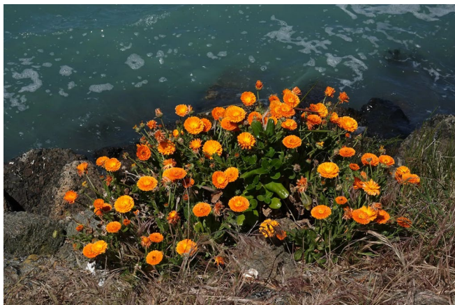
Figure 1. Full form— Calendula officinalis : pot marigold.