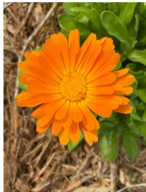
Figure 3. Flower— Calendula officinalis : pot marigold.