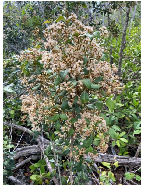
Figure 1. Full form, flowering— Myrcia neopallens : spicewood.

Spicewood ( Myrcia neopallens ) is an upright evergreen shrub to small tree in the myrtle ( Myrtaceae ) family, native to south Florida. It has an oval growth habit and reaches a spread of 10 feet and height of 15 feet (Figure 1). Its leaves, which have a unique spicy fragrance, give this plant its popular common name, spicewood. Leaves are small, light green, glossy, and have a pink to red tinge when young (Figure 2). Spicewood produces beige, fragrant flowers from spring through summer (Figure 3). The flowers open when a small lid flips up from the floral cup. The fruits change from green to orange, red, yellow, and then black (Figure 4). The tree and the fruits are appealing to many species of birds; the smaller birds use the tree as cover. Spicewood is a suitable plant for a screen, standard, or hedge. It may also be used as a border in the landscape.