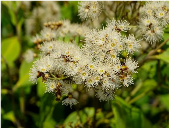
Figure 3. Flower— Myrcia neopallens : spicewood.