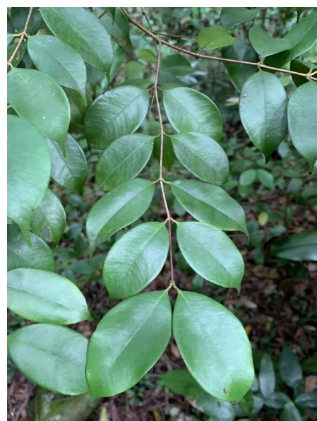
Figure 2. Leaf— Myrcia neopallens : spicewood.