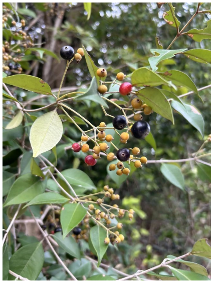
Figure 4. Fruit— Myrcia neopallens : spicewood.