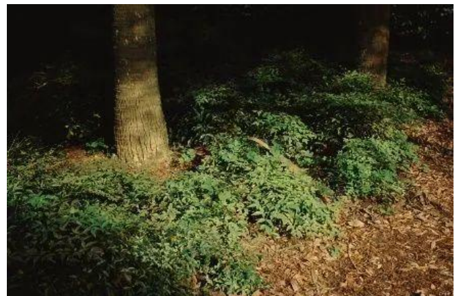
Figure 1. Full Form - Nandina domestica 'Harbor Dwarf': Harbor dwarf nandina.

'Harbor Dwarf' nandina is a dense, compact cultivar of Nandina domestica . It branches from the ground to form a dense mound about 18 inches in height. Dwarf nandina has smaller leaves and more branches than the species. Small, pink, or bronze, tripinnately compound, leaves emerge in spring and turn orange to red in the winter. The flowers and fruits of this cultivar are also smaller than the species and less abundant.