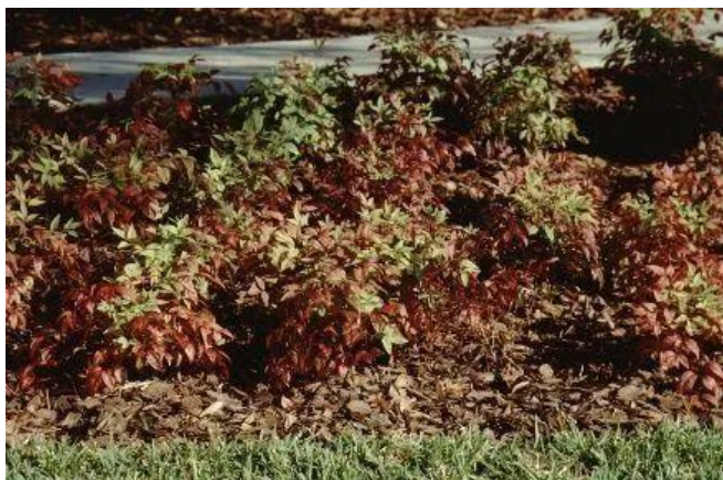
Figure 2. Full Form, Fall Color - Nandina domestica 'Harbor Dwarf': Harbor dwarf nandina.