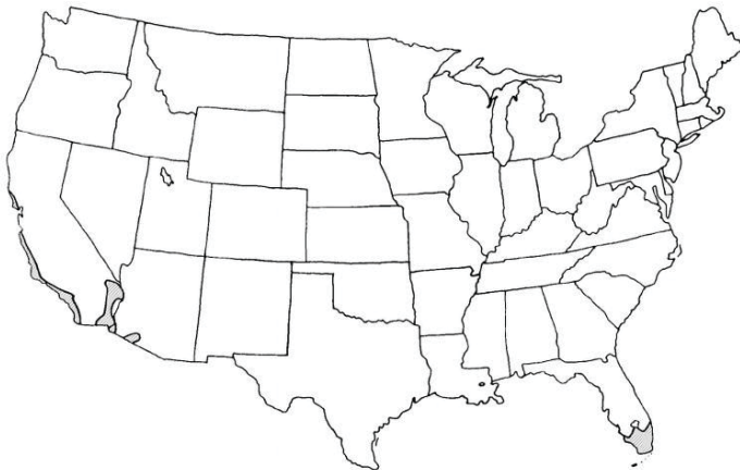
Figure 4. Shaded area represents potential planting range.

Availability: somewhat available, may have to go out of the region to find the plant