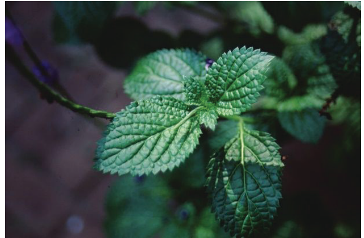
Figure 2. Leaf - Stachytarpheta jamaicensis : Blue porterweed.