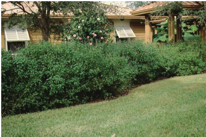
Figure 1. Full Form - Stachytarpheta jamaicensis : Blue porterweed.

Porterweed is a small perennial shrub that becomes woody toward the base of the stem as it grows to about one year old. Plants grow about 4 feet tall by 6 feet wide before stems droop and touch the ground. Blue or pink flowers are borne terminally on long, stringy spikes at the ends of the stems. They attract butterflies to the landscape. Rich, dark green foliage displayed on square, green stems makes porterweed a nice addition to any sunny landscape.