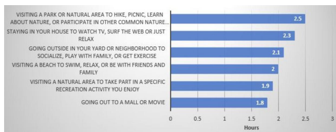
Figure 3. Average number of hours participants would spend participating in recreation activities.

they had 12 hours of free time, respondents said they would spend the most time "visiting a park or natural area to hike, picnic, learn about nature, or participate in other common nature activities." In fact, participants said they would hypothetically spend an average of 2.5 hours participating in nature-based recreation, which slightly beat out the next most popular leisure activity, "staying in your house to watch TV, surf the web, or just relax," which received an average response of 2.3 hours. The least popular option was "going out to a mall or movie," with an average response of 1.8 hours.