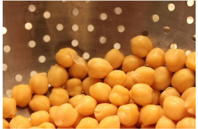
Figure 6. Chickpeas. Credit: Judith Doyle, used here under Creative Commons license CC BY-ND 2.0. Source: http://flic.kr/p/7RXtSC