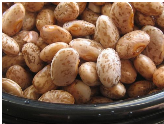
Figure 5. Pinto.