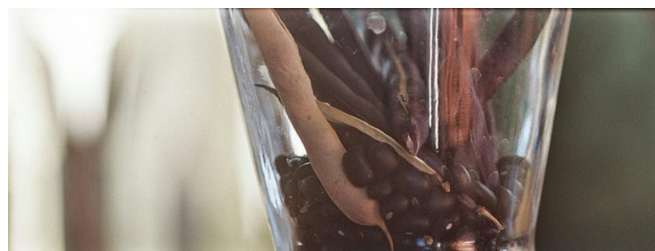
Figure 1. Black turtle.

Beans, peas, and lentils are also called legumes or pulses . A wide variety of pulses is found all over the world, each with a unique color, shape, and flavor. Some commonly consumed beans, peas, and lentils are featured throughout this publication.