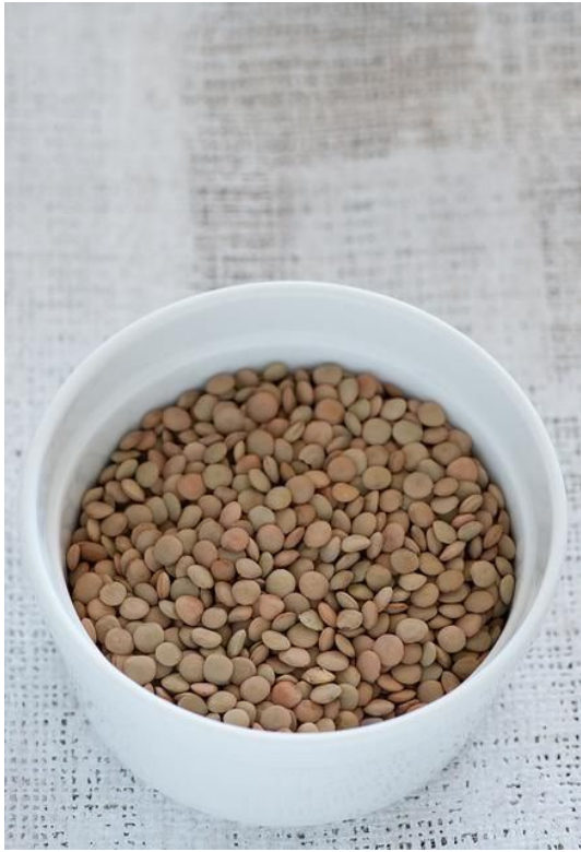
Figure 4. Brown lentils.