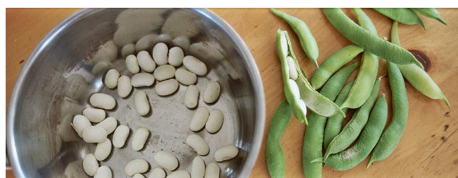
Figure 2. Cannellini.