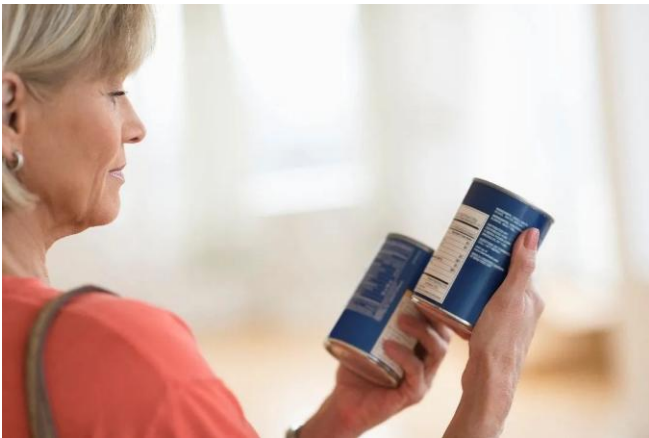
Figure 1. Most canned soups and soups from restaurants are very high in sodium. It is better to make soups at home from scratch to control the amount of salt you add.

Sodium is a mineral the body needs in small amounts for several important functions. This mineral allows nerves and muscles to function properly and keeps fluids in the body in proper balance. We find sodium in foods mostly as sodium chloride , another name for table salt .