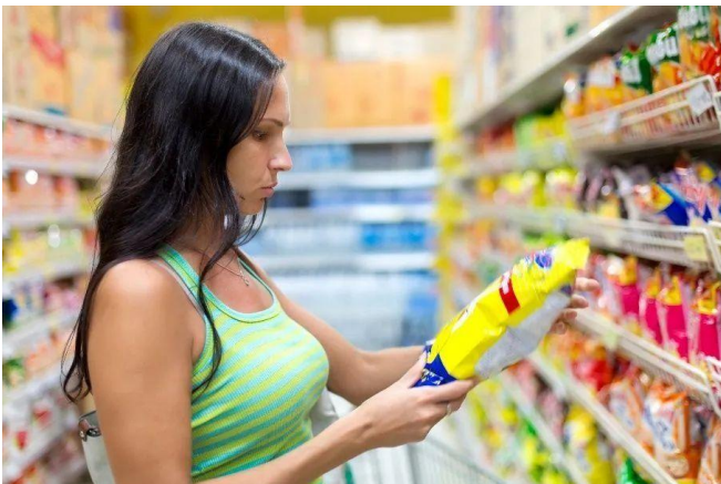
Figure 3. Chips are an energy dense food, contributing many calories but few nutrients. Chips also often contain high amounts of sodium.