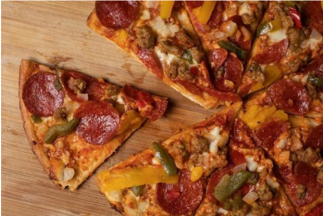
Figure 2. This pizza is likely very high in sodium due to the toppings of sausage, pepperoni, and cheese. The tomato sauce and bread may be contributing substantial sodium as well, depending on the recipe.

To cut down the sodium in your diet, consume these foods less often, or choose low-sodium varieties when available.