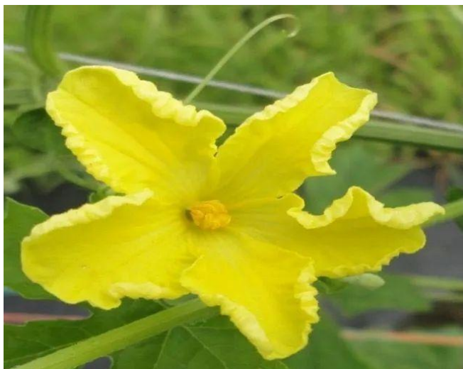
Figure 5. Bitter melon's male flower.