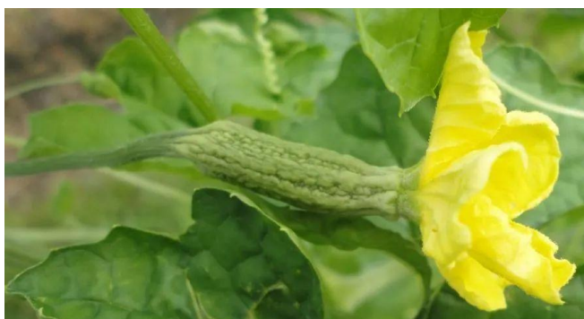
Figure 6. Bitter melon's female flower.

There are two types of bitter melon: Chinese variety and Indian variety, named due to the preference of these varieties in China and India, respectively. The former is longer and larger in size (usually 8 to 12 inches in length and 2 to 3 inches in diameter), smooth, light green in color, and oblong-shaped with a distinct warty appearance. The latter is shorter and smaller in size with rough skin, dark green coloration, and pointed ends. Both types have ridges, but Chinese bitter melon ridges are smooth (Figure 7), and Indian bitter melon ridges are pointed (Figure 8).