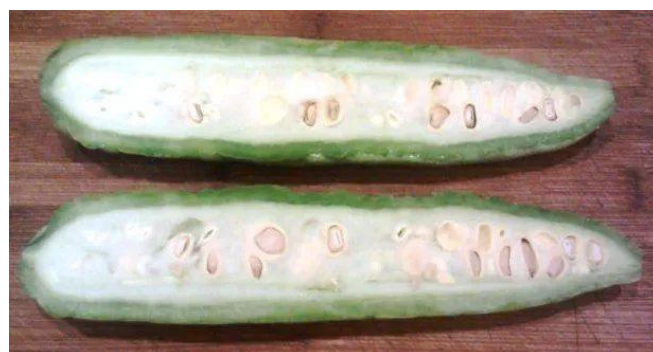
Figure 9. Two halves of Chinese bitter melon.

According to the USDA-ARS National Nutrient Database, bitter melon is an excellent source of vitamin C, folate (vitamin B9), and other nutrients such as zinc and potassium (Table 1). Bitter melon fruit are harvested when the fruit is green or slightly yellow. They are cut into halves and the seeds are removed and discarded. The sliced fruit is then consumed with stir-fry cooking (Figure 9). The fruit flesh is often used in Chinese cuisine with sliced garlic, chicken eggs, pork, or "douchi," a type of fermented and salted black soybean (Figure 10). In Indian dishes, the sliced fruit is marinated in a solution of salt and tamarind before being pan-fried with spices.