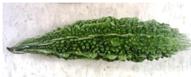
Figure 8. Indian bitter melon fruit.

According to the USDA-ARS National Nutrient Database, bitter melon is an excellent source of vitamin C, folate (vitamin B9), and other nutrients such as zinc and potassium (Table 1). Bitter melon fruit are harvested when the fruit is green or slightly yellow. They are cut into halves and the seeds are removed and discarded. The sliced fruit is then consumed with stir-fry cooking (Figure 9). The fruit flesh is often used in Chinese cuisine with sliced garlic, chicken eggs, pork, or "douchi," a type of fermented and salted black soybean (Figure 10). In Indian dishes, the sliced fruit is marinated in a solution of salt and tamarind before being pan-fried with spices.