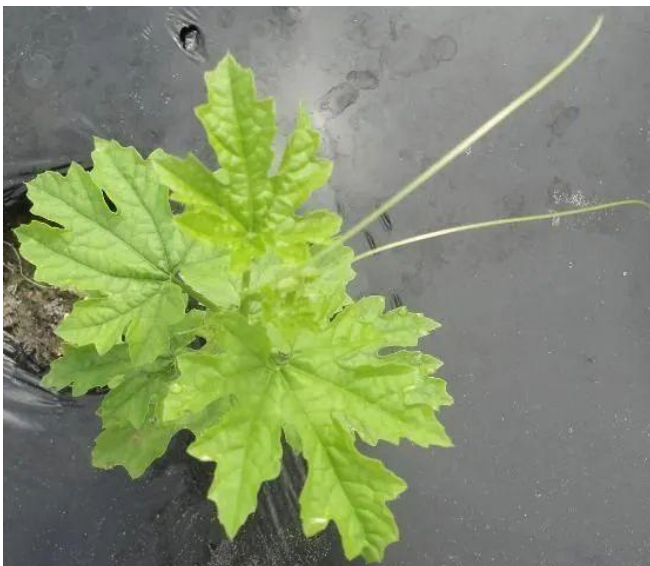
Figure 2. The bitter melon vine starts bearing tendrils for climbing when the plant has between four and six leaves.