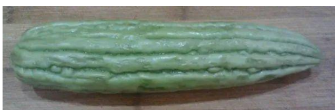
Figure 7. Chinese bitter melon.

There are two types of bitter melon: Chinese variety and Indian variety, named due to the preference of these varieties in China and India, respectively. The former is longer and larger in size (usually 8 to 12 inches in length and 2 to 3 inches in diameter), smooth, light green in color, and oblong-shaped with a distinct warty appearance. The latter is shorter and smaller in size with rough skin, dark green coloration, and pointed ends. Both types have ridges, but Chinese bitter melon ridges are smooth (Figure 7), and Indian bitter melon ridges are pointed (Figure 8).