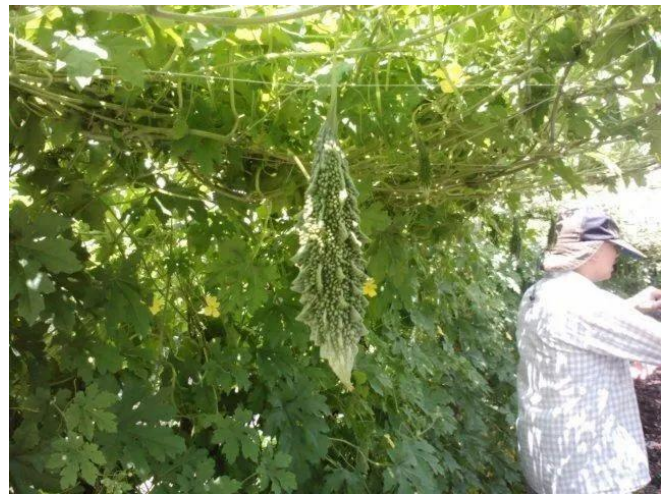
Figure 3. Six-foot tall trellis systems provide support for bitter melon vines.