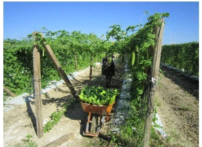
Figure 4. Bitter melon field with permanent trellis during harvest in south Florida.