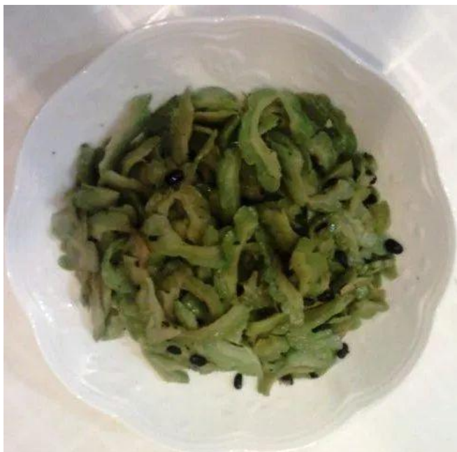
Figure 10. Cooked bitter melon with douchi, a type of fermented and salted black soybean.

Bitter melon has been used in Asian and African herbal medicine systems for a long time. Ethnobotanical uses in India suggest that this crop can lower blood sugar levels in diabetic patients (Paul and Raychaudhuri 2010). There are also studies that show its efficacy against various cancers such as breast cancer, choriocarcinoma (a fast-growing form of cancer that occurs in a woman's uterus), Hodgkin's disease, human bladder carcinomas, lymphoid leukemia, lymphoma, melanoma, prostate cancer, skin tumor, and squamous carcinoma of the tongue and larynx (Grover and Yadav 2004). Bitter melon extracts are also reported to have anti-obesity effects as well as other medicinal effects (Wang and Ryu 2015).