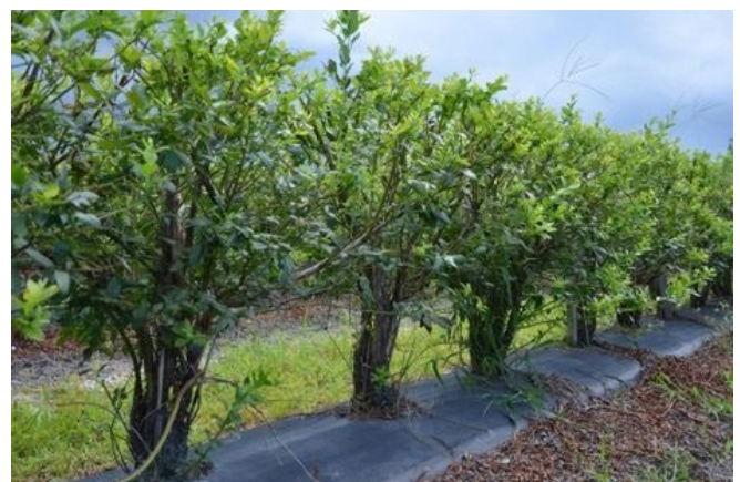
Figure 2. 'Farthing' plant previously trained to a narrow crown with cartons.