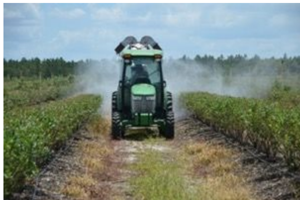
Figure 6. Fungicide application immediately following summer pruning.