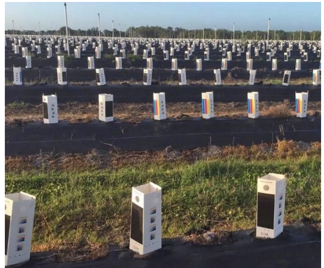
Figure 1. Cardboard cartons on young blueberry plants.

Many growers interested in machine harvesting have begun to place cardboard milk or juice cartons over new plantings during the first two years to train the plant to have a narrower crown, which can help reduce ground loss during harvesting (Figures 1 and 2). The cartons may also protect young stems from herbicide damage, and (in certain cultivars) reduce the need for pruning of suckers emerging from the bottom of the plant. However, once the cartons are removed, continued pruning at the base of the plant is needed to maintain a narrow crown.