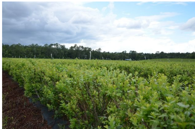
Figure 5. Regrowth following summer hedging and topping (mid-June).

trimming the sides of the plant so they do not overhang into the row middles. This method significantly reduces the cost of hedging compared to hand pruning. Growers on smaller farms may use handheld gas-powered trimmers. While many growers hedge straight across the top of the plant (Figure 3), some growers prefer a "rooftop" cut angled 45–55 degrees up to a point in the center of the plant canopy (Figure 4). Hedging promotes growth of the plant canopy and new fruiting wood; it is essential to vigorous, healthy growth throughout the summer and to maintaining consistent yield (Figure 5). Hedging also allows greater sunlight penetration into the canopy, possibly increasing the number of flower buds. While most southern highbush cultivars respond well to this pruning, it should be noted that 'Chickadee' does not. Several growers have reported that 'Chickadee' can struggle to achieve significant regrowth following hedging, especially after the plant is around 2 years old. These growers have adopted the practice of lightly tipping 'Chickadee' following harvest instead of the typical hedging.