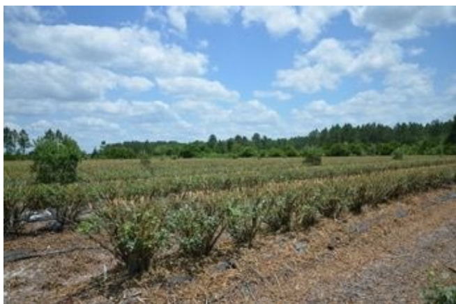
Figure 3. Blueberry field following mechanical hedging and topping done soon after completion of the harvest season.

In addition to promoting vegetative growth, hedging can help reduce disease pressure by removing inoculum (e.g., rust and Septoria) from the field. It will also open up the plant canopy to allow for better air flow (promoting faster foliage drying and therefore less fungal disease) and better coverage when spraying fungicides and insecticides. Hedging can also remove damaging insects from the plant's top growth, including blueberry bud mites and wax scale. Because hedging can create an entry point for disease pathogens such as Botryosphaeria (stem blight), it is important to spray a fungicide, such as captan, immediately after hedging to minimize the opportunity for plant infection (Figure 6).