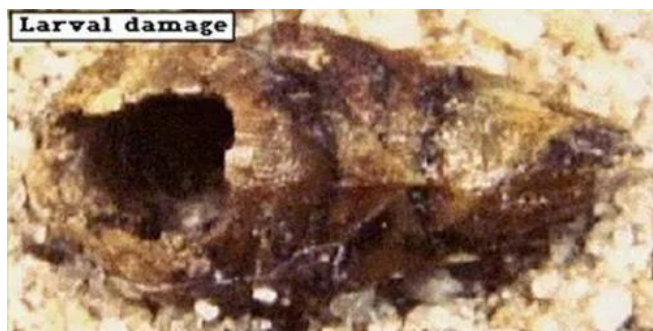
Figure 6. Damage caused by the larvae of the hydrilla tuber weevil, Bagous affinis , feeding on hydrilla tubers.

Adult Bagous affinis feed on hydrilla leaves, stems, turions, and tubers, although stems are preferred (Buckingham and Bennett 1994). When feeding, the adults often form aggregations with all individuals feeding on the same stem or tuber (Buckingham and Bennett 1994). On the stems, adults eat the tissue around the leaf nodes and often cause the stems to break. On the tubers, adults bore into and feed on the tissue as they move into the tuber. The larvae stay within the tubers, consuming plant tissue as they develop (Figure 6). This feeding degrades the tubers, so the tubers often fail to germinate once damaged.