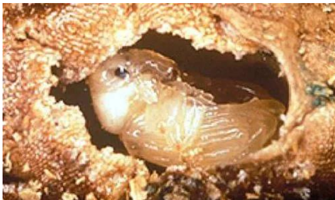
Figure 4. Pupa of the hydrilla tuber weevil, Bagous affinis in a tuber of hydrilla, Hydrilla verticillata .

Pupae of Bagous affinis (Figure 4) are off white to yellow with small red-brown bristles on the head and dorsum (Buckingham and Bennett 1994). Pupae are 3.75 mm long and 1.81 mm wide (Buckingham and Bennett 1994). The pupae turn yellow as they approach pupation. One day before eclosion, adult features become apparent, the eyes and leg joints darken, and the tips of the mandibles turn red (Buckingham and Bennett 1994).