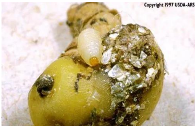
Figure 3. Larva of the hydrilla tuber weevil, Bagous affinis on a tuber of hydrilla, Hydrilla verticillata .

head capsule width in the second instar is 0.40 mm and that of the third instar is 0.66 mm (Buckingham and Bennett 1994). The first instar bores into the tubers of hydrilla, and larval development occurs within the tuber.