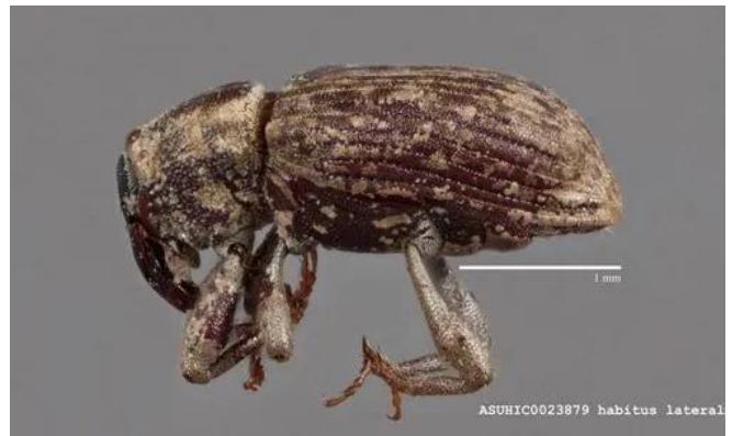
Figure 5. Adult of the hydrilla tuber weevil, Bagous affinis .

Adult Bagous affinis are small brown weevils with light-colored mottling (Figure 5). Adults are on average 3.5 mm long and 1.5 mm wide (Buckingham and Bennett 1994). The males and females can be distinguished by the shape of the first abdominal sternite. The sternite is concave in males and convex in females (Buckingham and Bennett 1994).