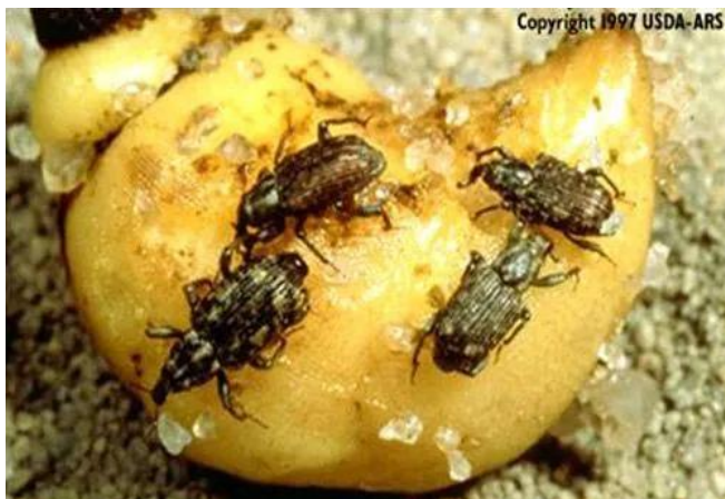
Figure 1. Adults of the hydrilla tuber weevil, Bagous affinis on a tuber of Hydrilla verticillata .

Bagous affinis Hustache (Figure 1) is a semi-aquatic weevil that feeds on the aquatic invasive plant Hydrilla verticillata (L.f.) Royle. The larvae of the weevil mine hydrilla tubers, whereas the adults feed on the submerged stems and leaves. The weevil was discovered during surveys for biological control agents for hydrilla in Pakistan in 1980 and was first introduced to the U.S. in Florida from India in 1987. A closely related weevil from Australia, Bagous hydrillae O'Brien (Insecta: Coleoptera: Curculionidae), was introduced to the U.S. in 1991.