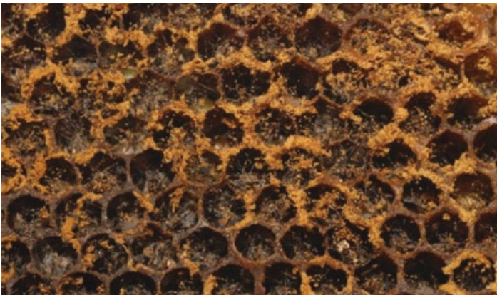
Figure 6. Wax moth damage to wax comb. The damage is the result of wax moth feeding, larval webbing, and frass.

Lesser wax moths are most damaging in stored comb that is not protected by resident bees (Figure 6). Beekeepers who do not take precautions to prevent wax moth infestations may find their stored combs infested with wax moths. Lesser wax moth eggs can be deposited around honey bee products, such as pollen and comb honey, before their removal from the colony. These eggs can hatch and the resulting larvae make the products unsellable. This can be avoided by beekeepers if they freeze hive products to be used for human consumption for at least 24 to 48 hours.