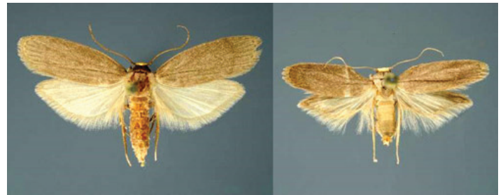
Figure 4. Comparison of female (left) and male (right) lesser wax moths, Achroia grisella Fabricius. Photos are at the same scale. Note that the male is smaller than the female.

Lesser wax moth adults are approximately ½ inch long and have slender bodies. Their wingspan is approximately ½ inch wide. Generally, males are smaller than females (Figure 4). Their coloration ranges from silver-gray to beige and they have a prominent yellow head. Adults live approximately one week and are most active at night. Mating typically occurs within honey bee hives and males attract females to mating sites with ultrasonic signals. Females also lay their eggs at night. During the day, adults remain hidden in trees and bushes near hives.