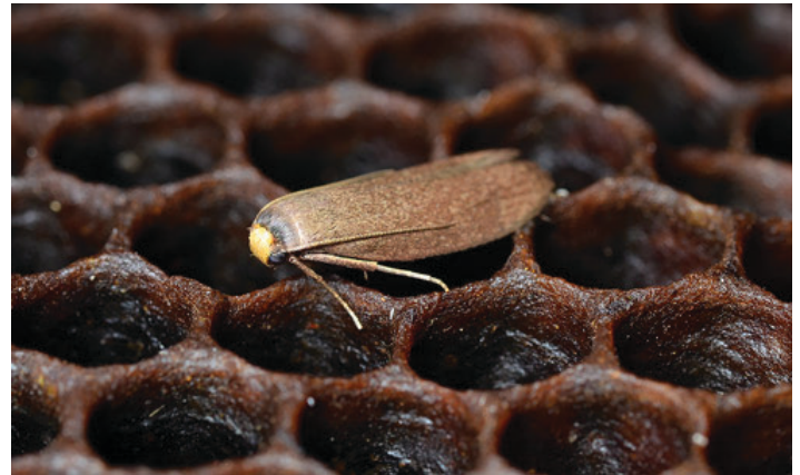
Figure 1. An adult lesser wax moth, Achroia grisella Fabricius, on a piece of brood comb.

Lesser wax moths are cosmopolitan in distribution and are present nearly anywhere honey bees are managed. The lesser wax moth is more successful in warmer tropical and subtropical climates and cannot survive long periods of freezing temperatures. However, the lesser wax moth can survive at higher latitudes and lower temperatures than can the greater wax moth.