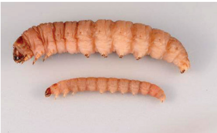
Figure 3. Late instar greater wax moth, Galleria mellonella L., larva (top) and lesser wax moth, Achroia grisella Fabricius, larva (bottom). The two species are similar in appearance with the major difference being size.

The larvae have narrow, white bodies with a brown head and pronotal shield (Figure 3). Larval development can take between one and five months, at an average of six to seven weeks at 29° to 32°C. The larvae undergo seven molts. Most of the larval growth happens within the last two instars and mature larvae are approximately 20 mm long. Larvae tunnel through beeswax comb spinning tunnels of silk, which they cover in frass (feces). The larval stage is the only life stage that eats. Larvae typically consume comb containing bee brood (honey bee larvae and pupae), pollen, and honey. Larvae prefer brood and pollen comb to virgin and/or honey comb. However, lesser wax moths are often found feeding on the hive floor because greater wax moths outcompete them for the desirable brood comb in areas where both species co-occur.