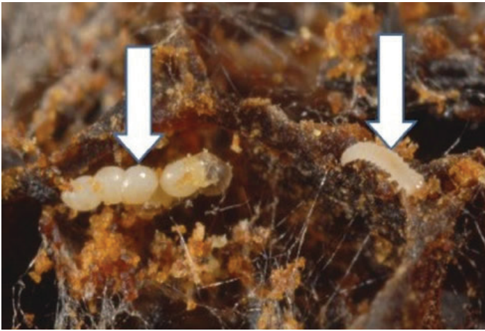
Figure 2. Eggs (left) and a first instar (right) of the greater wax moth, Galleria mellonella L., shown here due to the lack of images of lesser wax moth, Achroia grisella Fabricius, eggs and first instar larvae. Lesser wax moth eggs are very similar to the eggs of the greater wax moth.