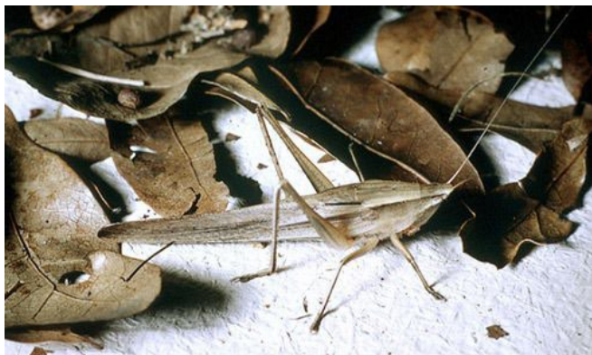
Figure 7. Brown adult male, Neoconocephalus triops (L.), among brown leaves.

and females display brown coloration and the remaining adults are green (Figure 8) (Capinera et al. 2004).