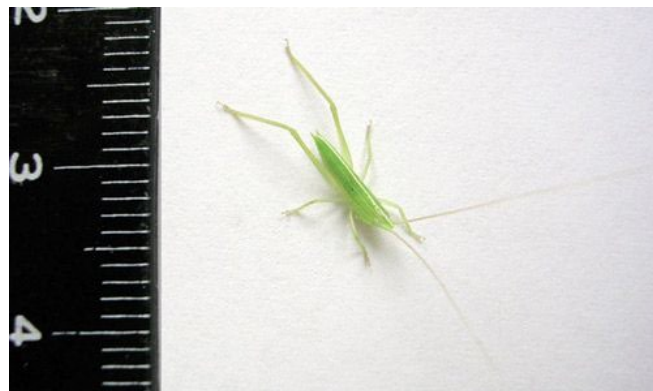
Figure 6. Second instar of Neoconocephalus triops (L.) reared in a laboratory.

Rather, they change from green to brown during late-instar molts, usually the last molt (SINA 2014a). Juveniles of the Neoconocephalus spp. are found among grasses, feeding on the grass flowers and developing seeds (SINA 2014c). Nymphs reach adulthood after about seven weeks (Whitesell 1974).