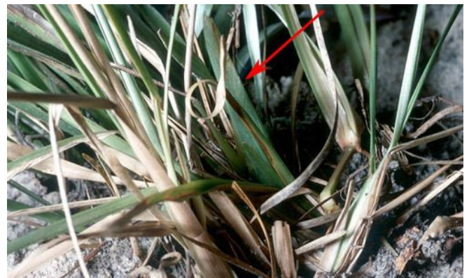
Figure 4. Green Neoconocephalus triops (L.) adult female hidden in grass. Only the forewing (as indicated by the red arrow; altered with permission) and extended hind leg are visible.