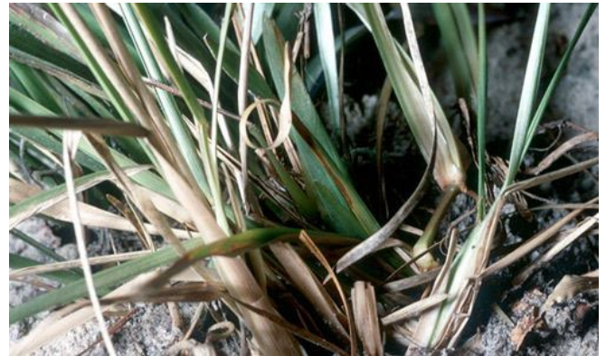
Figure 3. Green Neoconocephalus triops (L.) adult female hidden in grass. Can't find her? Scroll down to Figure 4.

Coneheaded katydids have oversized jaws and a relatively large body, with adult females (except for Belocephalus spp.) generally much larger than males. Their bodies are covered by long, narrow, leathery forewings (SINA 2014a, Capinera et al. 2004). Both adult males and females are strong fliers and tend to be attracted to lights (SINA 2014b). When disturbed, adult coneheads will fly off or dive down into the ground, burying their head to make their body appear as grass (Figures 3 and 4) (Capinera et al. 2004).