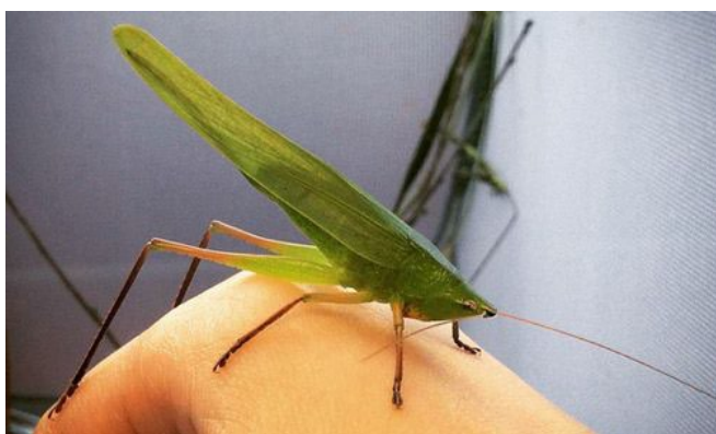
Figure 8. Green adult female, Neoconocephalus triops (L.). Note the ovipositor between the wings.