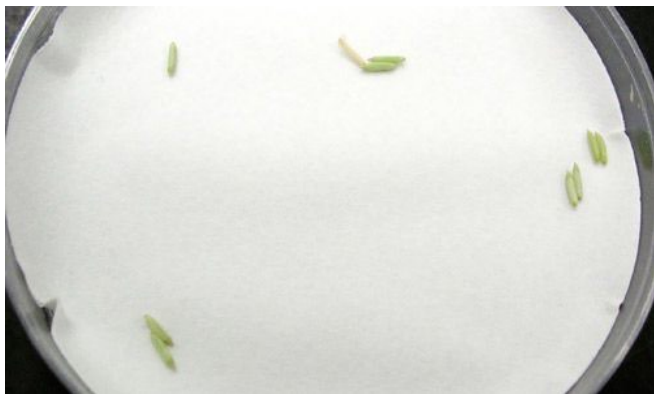
Figure 5. Eggs of Neoconocephalus triops (L.) in a shallow dish.

The eggs are light green in color and are long and oval-shaped with pointed ends (Figure 5). Coneheaded katydids oviposit in grasses in between stems and sheaths of roots or leaves (SINA 2014a). In captivity, oviposition in the soil has been recorded, and the captive-bred hatchlings emerge after about eight weeks (Whitesell 1974). All other Neoconocephalus spp. overwinter as eggs except for the broad-tipped conehead, which overwinters during the adult stage (Capinera et al. 2004).