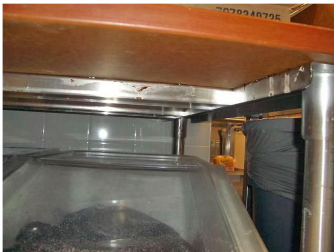
Figure 13. Do not use bait as if it were caulk. Follow label directions on application and number of placements.