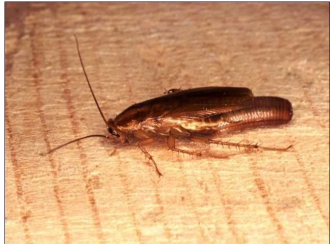
Figure 3. Females can be seen carrying a yellowish-brown ootheca (egg case) protruding from the end of the abdomen.