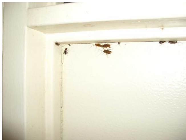
Figure 7. German cockroaches during the daytime, spilling out of cracks and crevices. It may mean that the population is extremely large. Plan management efforts accordingly.