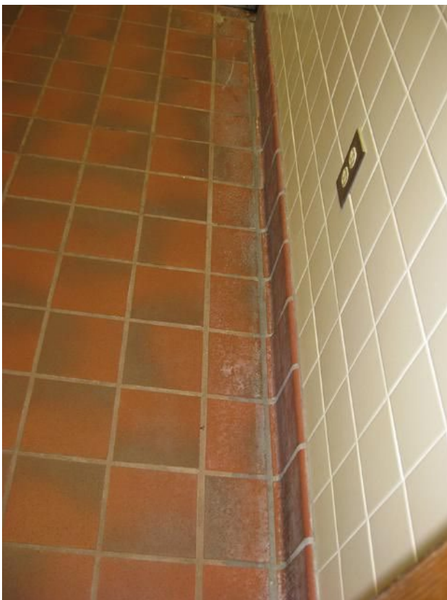
Figure 16. The telltale spray pattern of an ineffective baseboard application. This kitchen was still infested with German cockroaches.