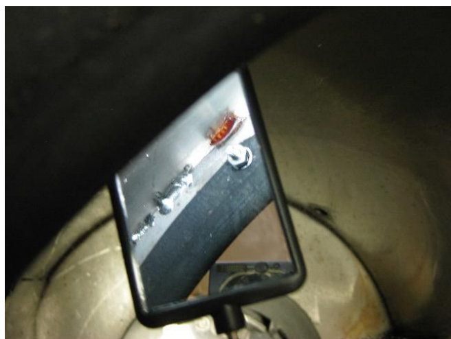
Figure 5. Use an inspection mirror and flashlight to help you see under and around areas that are difficult to reach. Inspection mirrors can be found in any hardware or auto mechanic store.