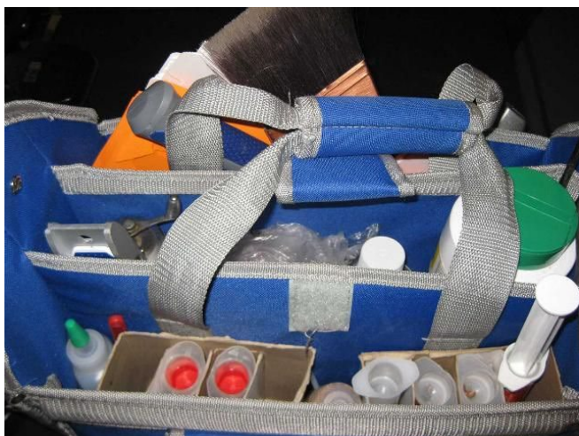
Figure 14. Keep your bait stored separately from products that might contaminate your bait. Do not leave your bait in the lockbox or cab of your truck when it is hot. Heat will degrade your product and make it runny and difficult to apply. This kit is an excellent example of how to keep your bait.