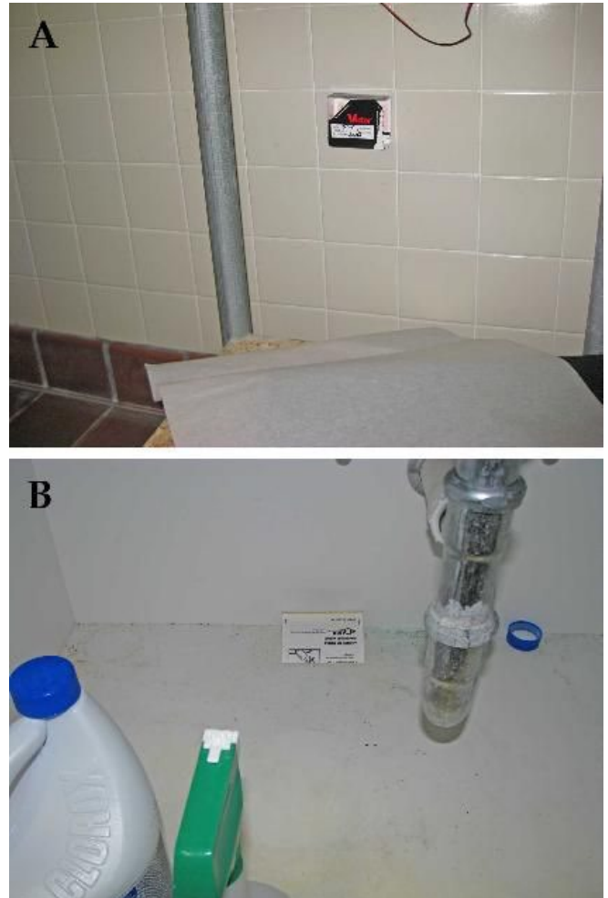
Figure 9. Properly placed versus improperly placed monitors. Placement of sticky traps includes placing monitors in dry areas along structural lines, adjacent to walls, corners, etc., where cockroaches travel and close to suspected cockroach harborages.