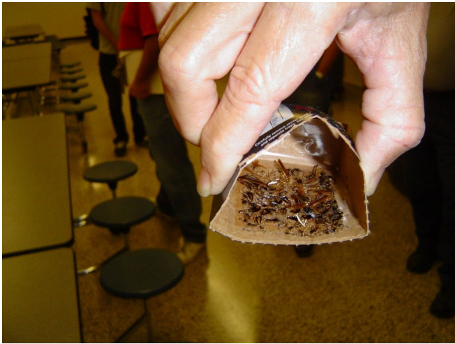
Figure 10. Knowing how to “read” a monitor is critical to IPM success. This monitor indicates that there is a severe German cockroach infestation because it contains several stages of nymphs as well as adults. Monitors can sometimes tell you from what direction the cockroaches are coming and are useful during the evaluation process to confirm that your treatment is effective as numbers decrease.