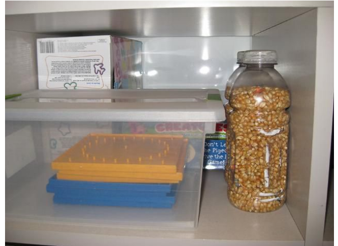
Figure 12. Store any items cockroaches will eat, including art supplies, in sealed containers.