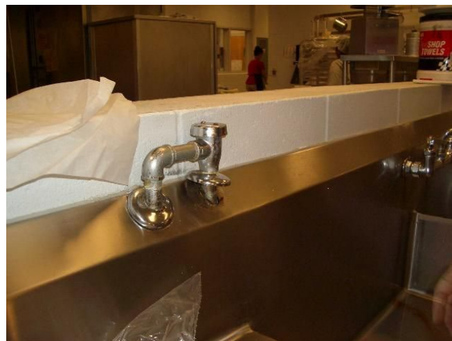
Figure 6. German cockroaches using unsealed escutcheon plates in a cafeteria sink as harborage. Inspection practices should include checking for unsealed openings such as missing or loose pipe and conduit escutcheon plates.