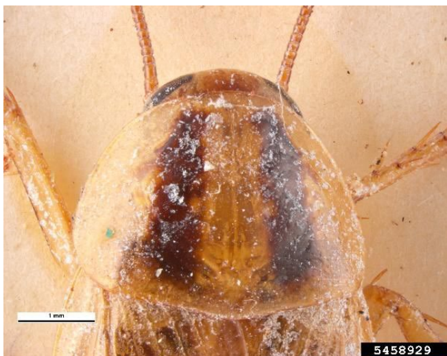
Figure 2. German cockroach female with two stripes on her pronotum (shield).