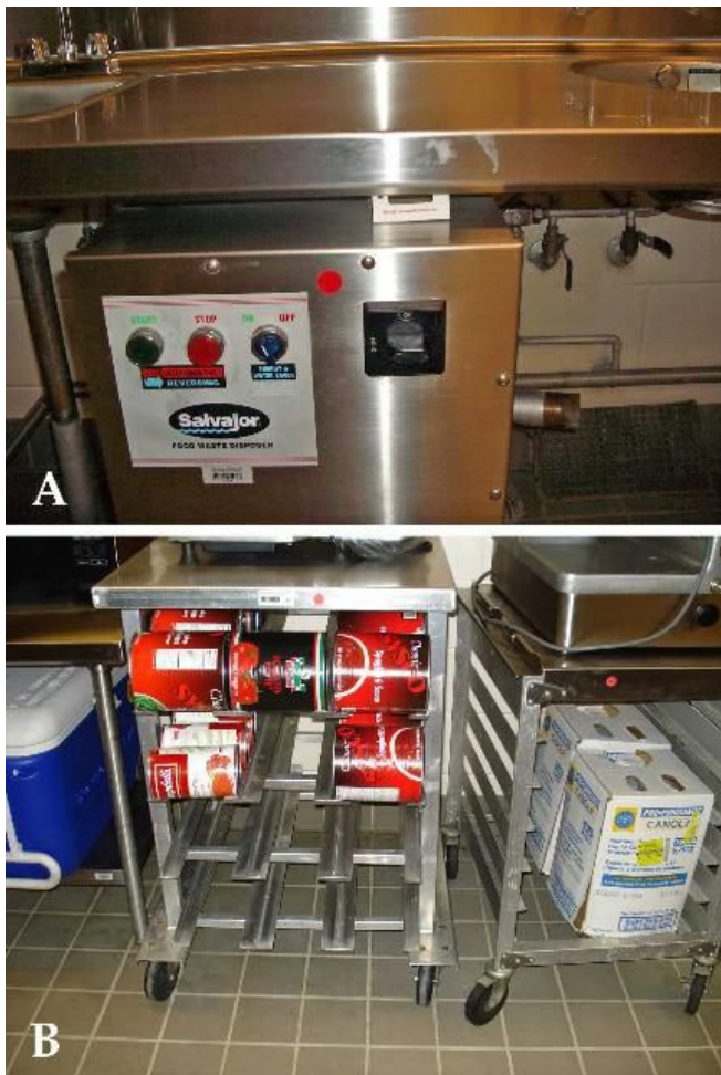
Figure 8. Use visual markers to help you locate monitors that are placed in hidden areas that also are often preferred cockroach harborages. Careful labeling of monitors is important. Always date and number monitors for documentation purposes. Consider drawing a map to help you locate monitors when numerous accounts are involved.