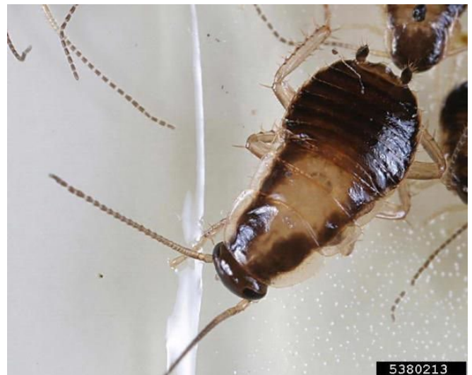
Figure 4. Nymphs are generally darker with two prominent dark stripes surrounding a lighter, tan spot or stripe on body thorax.