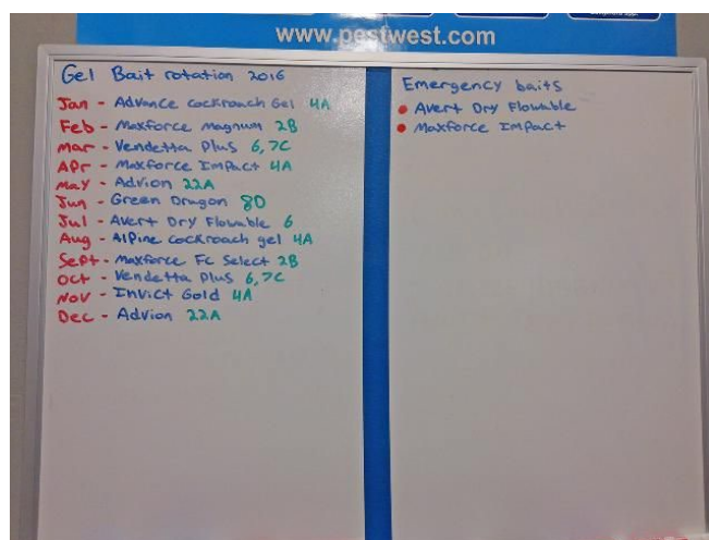
Figure 15. Product rotation schedule in an easily accessible location. Rotation is important to reduce the development of bait aversion and insecticide resistance. Technicians receive one type of bait at the beginning of the month at the same time the previous month's products are collected to ensure that the rotation is being followed. Numbers and letters after products refer to the Insecticide Resistance Action Committee (IRAC) groups that can simplify product selection by choosing products with different IRAC numbers.