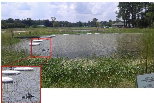
Figure 4. A typical habitat of the worms that cause swimmer's itch. Note the dense plant material (hydrilla) and the common moorhen family swimming on the bottom left; waterfowl are the main host of the parasite that causes swimmer's itch.