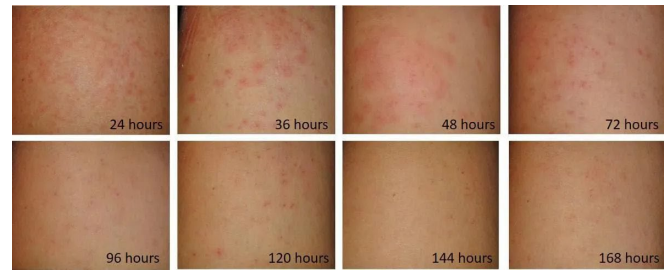
Figure 3. The development of the swimmer's itch rash over a week (168 hours); a case study.