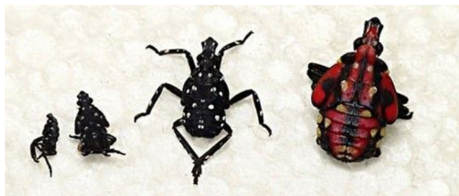
Figure 3. Four instars of Lycorma delicatula (White).

All four instars (nymphal growth stages) are mostly black, but the fourth and final instar has a different marking pattern. The first three instars have white spots and the fourth instar has red markings on the body (Figure 3). Early instars are easily knocked off trees by wind (Choi et al. 2012), but they fall less frequently as they develop (Kim et al. 2011). Nymphs aggregate on the host plant to feed, preferring woody stems as they grow older and progressing onto tree trunks and branches as they develop into the fourth instar. When the density of nymphs on a host plant is high, it is more likely that aggressive behavior between nymphs will occur as they compete for the best feeding locations. During these encounters, the residing nymph will raise its forelimbs at the approaching nymph, which will either leave or attempt to mount the residing nymph. If the residing nymph is mounted, it attempts to throw the intruder off. In this scenario, it is most likely for the original nymph to maintain control over its feeding space rather than the new nymph taking control (Choi et al. 2011).