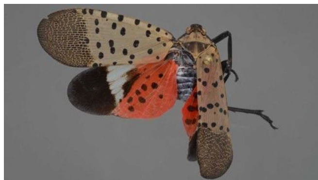
Figure 1. Adult Lycorma delicatula (White).

Originating from northern China, the spotted lanternfly, Lycorma delicatula (White), is a serious pest due to its high reproductive capacity and large host range. Spotted lanternfly is the approved ESA common name; however, these insects are also referred to as the spot clothing wax cicada, or the spotted wax cicada (Figure 1). The spotted lanternfly is not native to the Americas, although it has become established in Pennsylvania (Hao et al. 2016). The first report of the pest was in 2014 in Berks County, PA (Barringer et al. 2015), and an additional report was made in 2018 in Frederick County, VA (Day 2018), as well as in Delaware (Murillo 2018). It is unknown how far this infestation is able to spread.