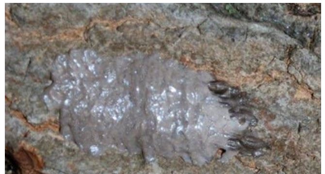
Figure 2. Egg mass of Lycorma delicatula (White).

During the fall, Lycorma delicatula lay their eggs in an ootheca, or egg casing, which is covered by a brownish gray waxy secretion (Figure 2). The species is univoltine; however, females lay multiple masses of eggs once per year. The spotted lanternfly overwinters in the egg stage on surfaces like trees with smooth bark, specifically Ailanthus altissima (tree of heaven; an introduced tree in the US, native to China) (Dara et al. 2015, Han et al. 2008), or even buildings (Zhai et al. 2014). Although the spotted lanternfly prefers stable and smooth surfaces, any surface with at least approximately 2.5 cm (0.98 in) of relatively smooth area will suffice (L. Donovall, personal observation).