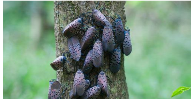
Figure 4. Cluster of spotted lanternfly, Lycorma delicatula (White).

males, having a body length of 20 to 25 mm (0.79 to 1 in) versus 17 to 20 mm (0.67 to 0.79 in) (Barringer et al. 2015). Another account measures females at 22 to 27 mm (0.87 to 1.06 in) and males at 21 to 22 mm (0.83 to 0.86 in) from head to tip of the wings (Dara et al. 2015). Females have longer legs as well, ranging from 18 to 22 mm (0.71 to 0.87 in) while the male leg length is between 15 and 18 mm (0.59 to 0.71 in) (Barringer et al. 2015).