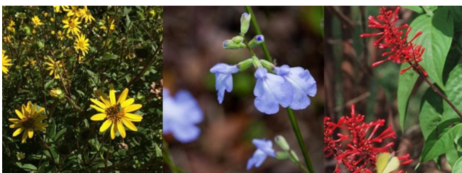
Figure 1. From left to right are examples of plants with relatively flat flowers, short-medium length flower tubes, and long flower tubes (from left to right: rosinweed Silphium sp., blue sage Salvia azurea , and firespike Odontonema cuspidatum ).

Generally, the best plants for bees will be those that have abundant and accessible pollen and nectar. Avoid pollen-free plant varieties (e.g., some sunflowers and lilies) because they will not provide pollen, which is the essential food source for bees. Additionally, choose plants with flat flowers or short to medium-length flower tubes (corollas), and limit plants with long flower tubes such as honeysuckle (Figure 1). Many native wild bees have relatively short proboscises, or tongues, and may not be able to access nectar from flowers with long tubes; however, flowers with long floral tubes can attract other pollinators with long tongues or beaks such as butterflies, moths, and hummingbirds.