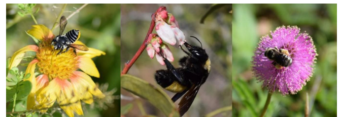
Figure 2. Flower colors that are highly attractive to native wild bees include yellow, white, and blue-purple (from left to right: blanketflower Gaillardia sp., blueberry Vaccinium sp., and mimosa Mimosa sp.).

Additionally, bees prefer white, yellow, or blue-purple flowers (Figure 2). Orange, pink, or red flowers are not as attractive to bees (but may be attractive to other pollinators). Finally, native plants are generally best for native bees (Isaacs et al. 2009; Morandin and Kremen 2012; Pardee and Philpott 2014). While bees may collect nectar from a variety of native and non-native plants, some specialist native bees require pollen from certain native plants in order to develop optimally. Non-native plants may provide abundant nectar for bees during times, or in places, with minimal native floral resources and can be useful in combination with native plants to increase resource availability.