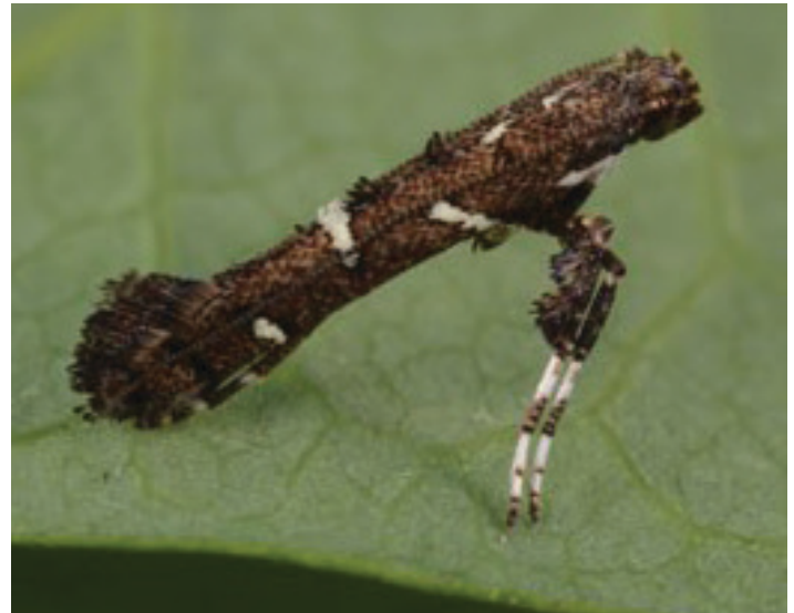
Figure 1. Adult tallow leaf roller moth, Caloptilia triadicae Davis.

Once the larvae exit the mines, they create rolls using the tallow leaves. One leaf may contain multiple rolls (Figures 3 and 4). Damage to the tallowtree is distinctive and can be so extensive that stunted shoot growth can be seen at the tops of trees up to six meters (20 feet) tall (Fox et al. 2012).