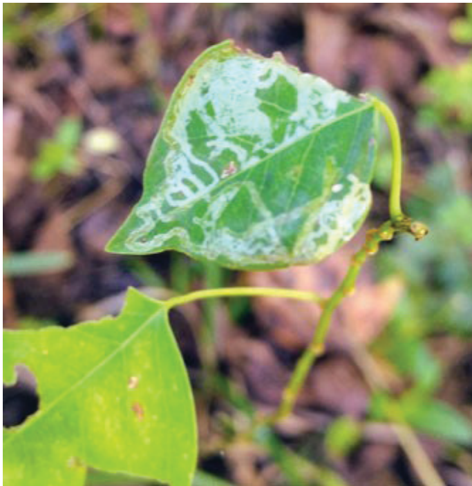
Figure 3. Mined leaf of Chinese tallowtree, Triadica sebifera , seedling.