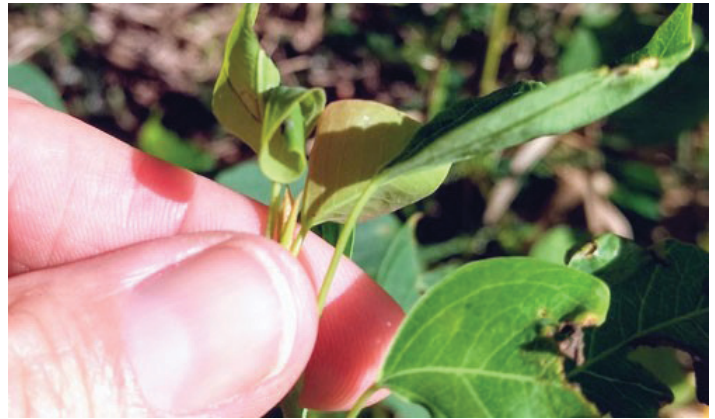
Figure 4. Rolled leaves of Chinese tallowtree, Triadica sebifera , seedling.