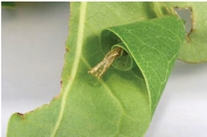
Figure 5. Pupal exuvia of a tallow leaf roller moth Caloptilia triadicae Davis, inside a leaf roll.

Adult moths are small, about 5mm long, and brown with three white stripes on each wing and white marking on the legs (Davis et al. 2013). A discarded exuvia will be visible hanging out of the roll once the adult moth has emerged (Figure 5). A dichotomous key to the identification of the four species of Triadica feeding moths is found in Davis et al. (2013).