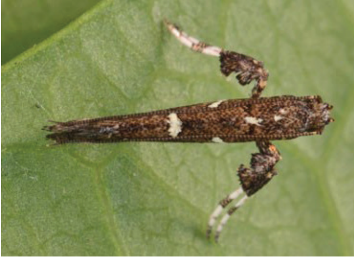
Figure 2. Adult tallow leaf roller moth, Caloptilia triadicae Davis.

(Esser 2002). Moreover, this species resembles three other species of Caloptilia from Asia that feed on trees in the genus Triadica (Davis et al. 2013). However, the tallow leaf roller has not been reported from its presumed native Chinese range (Davis et al. 2013). Fox et al. (2016) speculate that the moth is subject to a community of competitors in China, and thus has little impact on Chinese tallowtree in its native range.