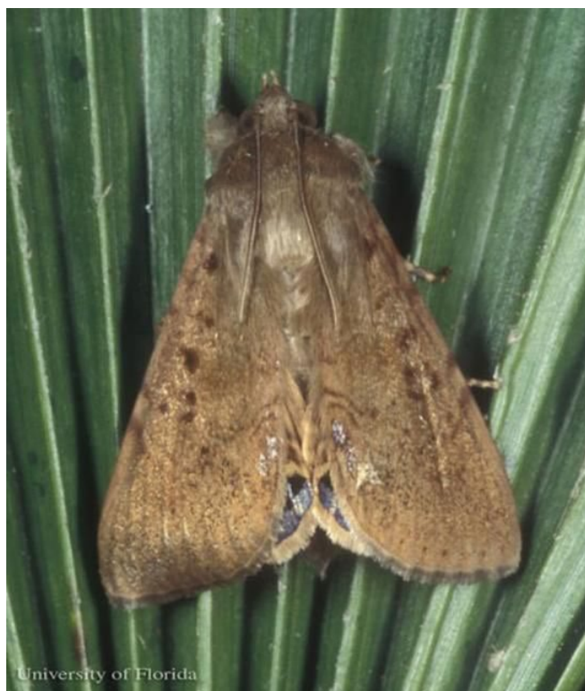
Figure 1. Adult cabbage palm caterpillar, Litoprosopus futilis (Grote & Robinson).

The cabbage palm caterpillar, Litoprosopus futilis (Grote & Robinson), sometimes referred to as the cabbage palm worm, is the larva of an owlet moth. The author has collected larvae feeding on the inflorescence of cabbage palmetto, Sabal palmetto . Severe infestations of this caterpillar can seriously affect the production of palmetto honey. These caterpillars may also cause problems by invading structures.