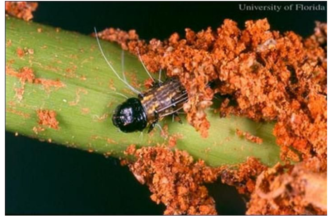
Figure 6. Cabbage palm caterpillar, Litoprosopus futilis (Grote & Robinson), in webbed frass shelter on flower stalk of palm.

The larva have extremely long, strong, white primary setae that arise from shiny black conical tubercles. Setigerous tubercles 1a and 1b (tubercles occurring on the scutellum or legs, each bearing a spine or bristle on its top.) are fused on the mesothorax and metathorax. The black bases of setae 1a and 1b on the mesothorax are ringed with white, and this is a very useful diagnostic character of the larva. The spiracles are entirely black. Prolegs with crochets in a mesoseries are present on abdominal segments three, four, five, and six. The larva becomes very pink just before pupating.