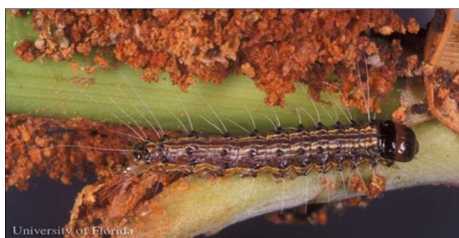
Figure 10. Close-up of webbed frass from the cabbage palm caterpillar, Litoprosopus futilis (Grote & Robinson), on a bloom spike of palm.