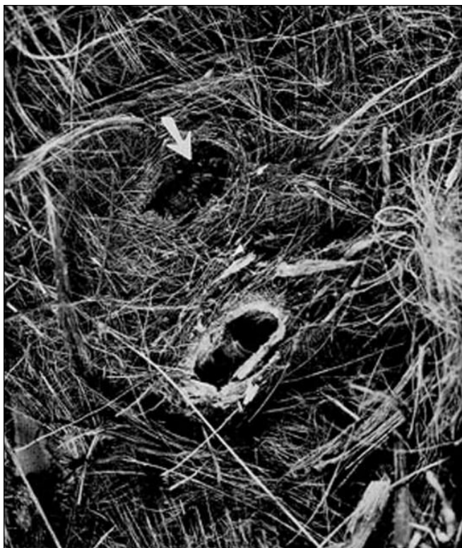
Figure 8. Cocoons of the cabbage palm caterpillar, Litoprosopus futilis (Grote & Robinson), constructed from palm fibers (arrow points to pupa).