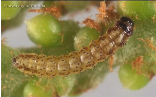
Figure 3. Early instar larva of the cabbage palm caterpillar, Litoprosopus futilis (Grote & Robinson).

The mature larva is about 1.5 inches in length. The larva is covered with very small black spines, which are not visible to the naked eye. The body appears pinkish in color, while the head and cervical shield are shiny black. When examined under low magnification (10x), the larva is taffy-colored with pinkish stripes extending from the cervical shield to the last abdominal segments.