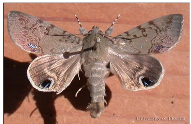
Figure 2. Adult cabbage palm caterpillar, Litoprosopus futilis (Grote & Robinson).

The adult moth is usually fawn-colored and has a wing expanse of about 2 inches. The body is the same color as the forewings. However, several color variations exist (Patterson 2010). A dark eyespot about 3/16 inch in diameter is found on each hind wing. Within each spot are two approximately parallel white dashes.