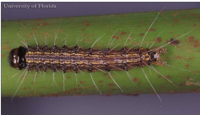
Figure 4. Dorsal view of a late instar larva of the cabbage palm caterpillar, Litoprosopus futilis (Grote & Robinson).