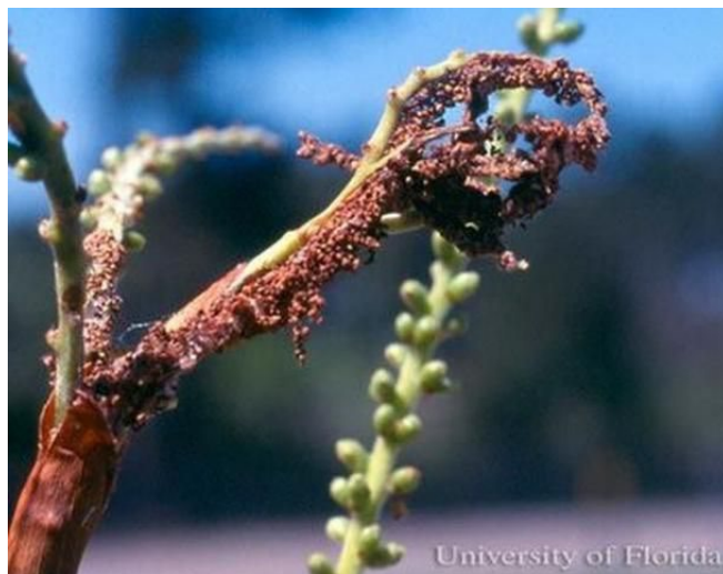
Figure 9. Cabbage palm caterpillar, Litoprosopus futilis (Grote & Robinson), webbed frass shelter on a bloom spike of palm.

The following account is from observations made by R.W. Massie, Geneva, Florida: "The palm caterpillar can usually be found on the cabbage palm at the time the embryonic bloom is in the small green bud stage. Tiny larvae may be found deep in the developing bloom spikes. The larvae sometimes gather in the thousands on the immature buds, entirely denuding the palms of all trace of bloom as they feed. The fully mature caterpillar may then drop to the ground on a silken thread and crawl to a protected pupation site or crawl down the trunk and beneath the base of a dead frond to construct a cocoon from dry palm fibers."