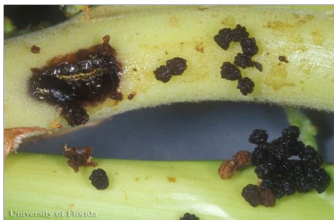
Figure 11. Damage caused by larva of the cabbage palm caterpillar, Litoprosopus futilis (Grote & Robinson). Frass removed to show hole in the flower stalk with caterpillar inside.