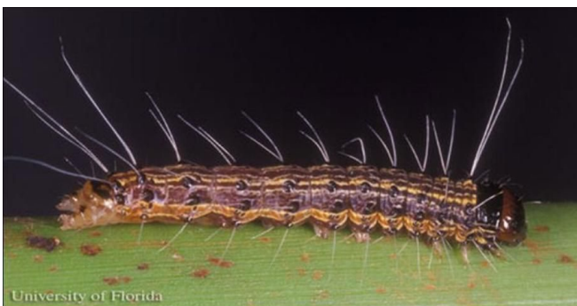
Figure 5. Lateral view of a late instar larva of the cabbage palm caterpillar, Litoprosopus futilis (Grote & Robinson).