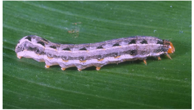
Figure 5. Mature larva (light form) of the southern armyworm, Spodoptera eridania (Stoll).