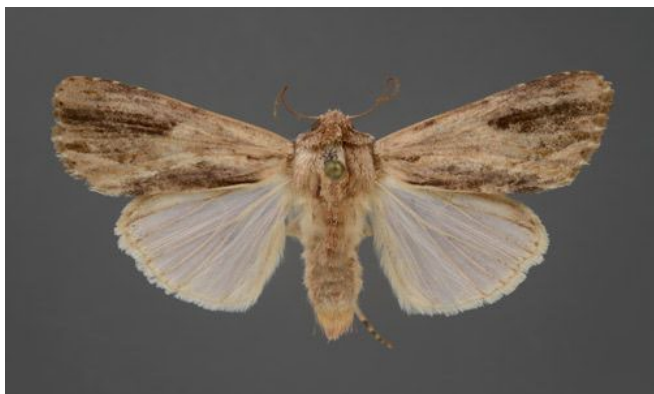
Figure 7. Adult male of the southern armyworm, Spodoptera eridania (Stoll).