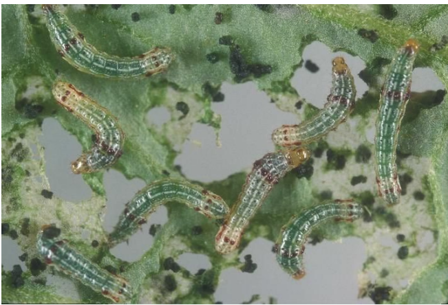
Figure 3. Southern armyworm, Spodoptera eridania (Stoll), second and third instar larvae on tomato.