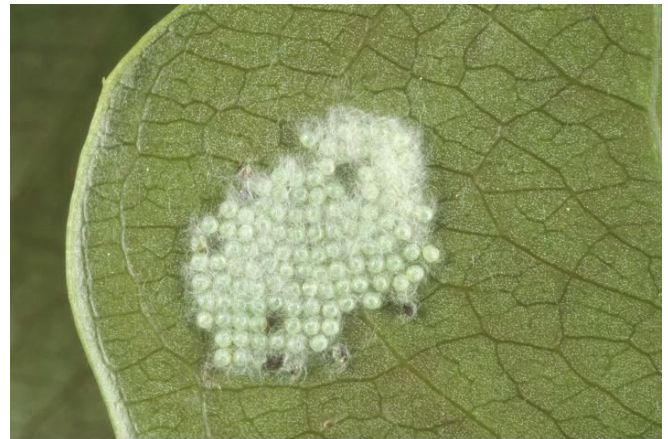
Figure 1. Eggs of southern armyworm, Spodoptera eridania (Stoll).

The shape of the eggs is a flattened sphere. Eggs measure about 0.45 mm (0.018 in) in diameter and 0.35 mm (0.014 in) in height. The eggs are greenish initially, turning tan as they age. Eggs are laid in clusters and covered with scales from the body of the moth. Duration of the egg stage is four to six days.