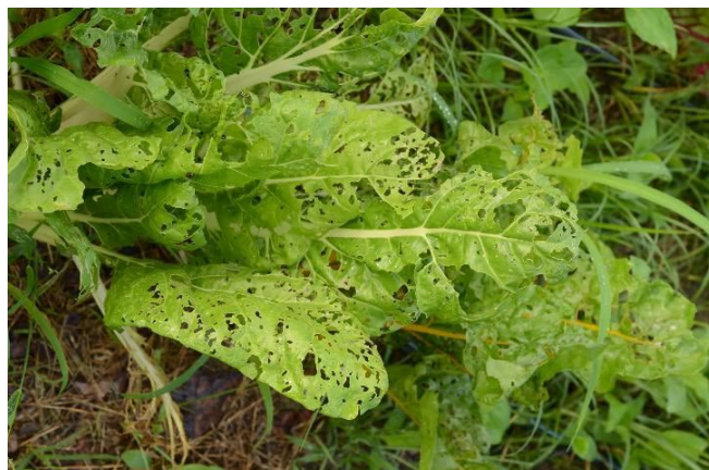
Figure 8. Foliar damage caused by larvae of the southern armyworm, Spodoptera eridania (Stoll).

Larvae are defoliators and feed gregariously while young, often skeletonizing leaves. As they mature they become solitary and also bore readily into fruit, often damaging tomato in Florida. When stressed by a lack of food, they will eat the apical portions of branches, bore into stem tissue, and attack tubers near the surface of the soil.