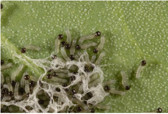
Figure 2. Southern armyworm, Spodoptera eridania (Stoll), neonate (newly hatched) larvae on tomato.