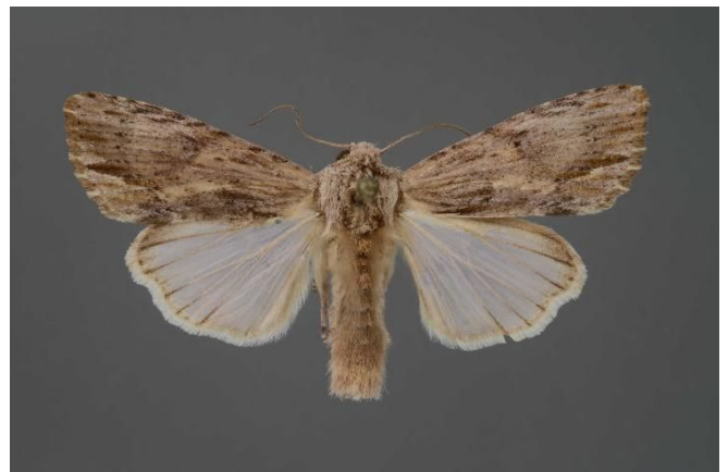
Figure 6. Adult female of the southern armyworm, Spodoptera eridania (Stoll).

The moths measure 33 to 38 mm (1 1/3 to 1 1/2 in) in wingspan. The forewings are gray and brown, with irregular dark brown and black markings. The wing pattern is highly variable; some individuals bear a pronounced bean-shaped (reniform) spot near the center of the wing, whereas others lack the spot or instead bear a broad black band extending from the center of the wing to the margin. In males, the spot usually takes the form of a dark streak, whereas in females the dark spot is weak or absent. The hind wings are opalescent white.