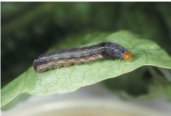
Figure 4. Late instar larva (dark form) of the southern armyworm, Spodoptera eridania (Stoll).