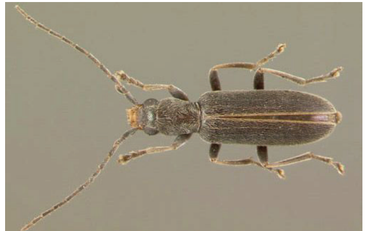
Figure 3. Adult Oxycopsis falli (Blatchley), a false blister beetle.

Oxycopsis falli (Blatchley). Adults of this species were first found by Blatchley by sweeping a fleshy crucifer on the beach near Cape Sable. It is known from Florida, ranging from Titusville and Cedar Key south through the Florida Keys (Dade and Monroe counties), and in the Bahamas, Grand Cayman, and the Dominican Republic. Specimens are taken by sweeping various grasses, and on oleander and corn flowers.