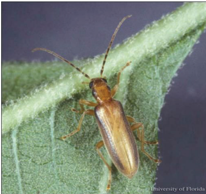
Figure 2. Adult Oxycopsis suturalis (Horn), a false blister beetle.

Oxycopsis suturalis (Horn). Although known from New Jersey southward through Florida, and west to Louisiana, it is most common in Florida, especially in the Florida Keys (Dade and Monroe counties). Adults are found on flowers of papaya, palmetto, and Metopium toxiferum (Linnaeus).