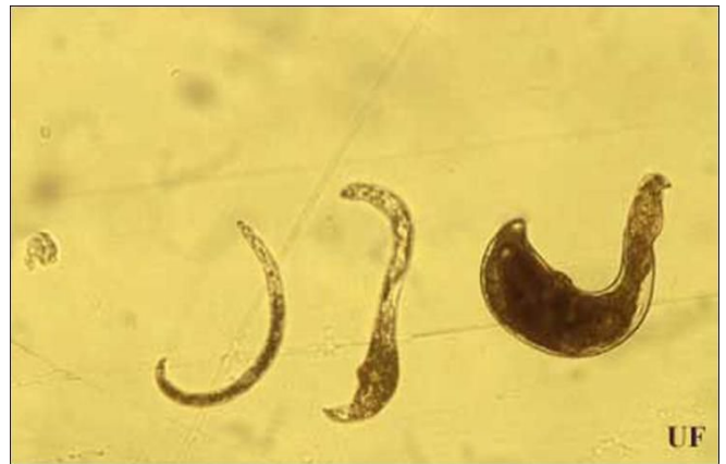
Figure 2. Life stages of reniform nematode, Rotylenchulus reniformis Linford & Oliveira. Ranging from left to right is egg, juvenile, young female with swollen body, and mature female in kidney shape.

Eggs hatch one to two weeks after being laid. The first-stage juvenile molts within the egg, producing the second-stage juvenile (J2) that emerges from the egg. The infective stage is reached one to two weeks after hatching. Once root penetration occurs, one or two more weeks are required for females to reach maturity. The male, which remains outside of the root, can inseminate the female before female gonad maturation. Sperm are stored in the spermatheca. Soon after female gonad maturation, the eggs are fertilized with sperm, and about 60 to 200 eggs are deposited into a gelatinous matrix. Typically, there is an equal number of females and males in a population. Some populations of reniform nematodes reproduce parthenogenetically (egg production without fertilization). The life cycle of this nematode is usually shorter than three weeks, but depends on soil temperature. However, it can survive at least two years in the absence of a host in dry soil through anhydrobiosis, a survival mechanism that allows the nematode to enter an ametabolic state and live without water for extended periods of time (Radewald and Takeshita 1964).