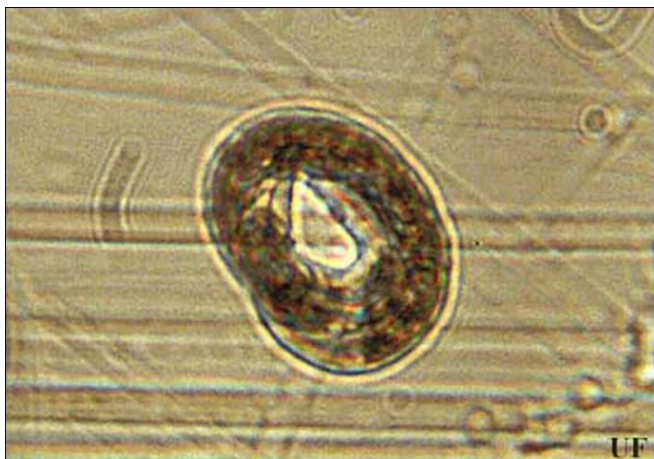
Figure 4. Reniform nematode, Rotylenchulus reniformis Linford & Oliveira, tightly coiled to undergo anhydrobiosis under drought conditions.