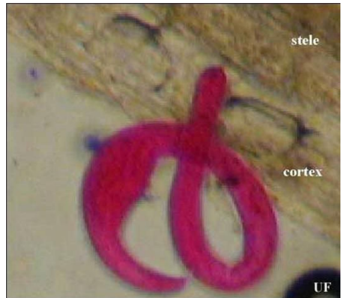
Figure 1. Young female of reniform nematode, Rotylenchulus reniformis Linford & Oliveira, with swollen body. The female penetrates the root of cowpea and the anterior portion (head region) of the body remains embedded in the root whereas the posterior portion (tail region) protrudes from the root surface.

Reniform nematodes in the genus Rotylenchulus are semiendoparasitic (partially inside roots) species in which the females penetrate the root cortex, establish a permanent-feeding site in the stele region of the root and become sedentary or immobile. The anterior portion (head region) of the body remains embedded in the root whereas the posterior portion (tail region) protrudes from the root surface and swells during maturation. The term "reniform" refers to the kidney-shaped body of the mature female.