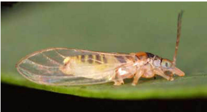
Figure 10. Female brown color morph of Glycaspis brimblecombei Moore, a psyllid.

Dead adults can be separated by the following couplet: