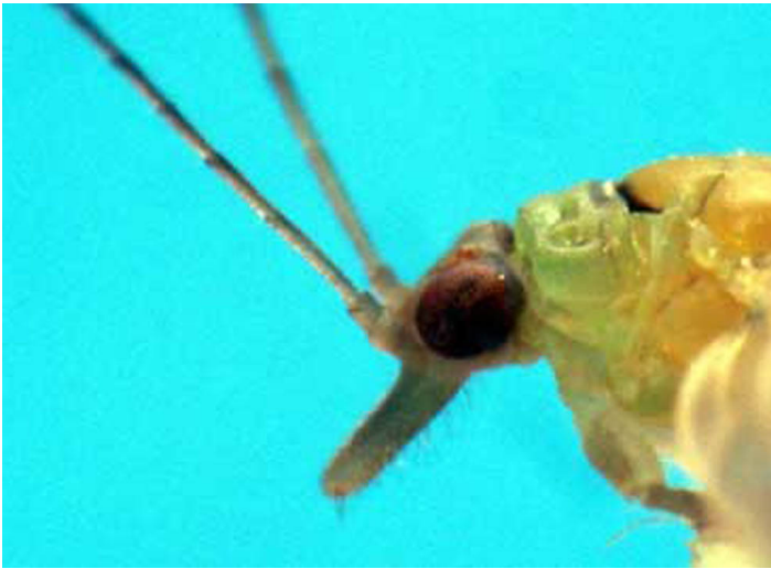
Figure 8. Lateral view of the gena of Boreioglycaspis brimblecombei Moore, a psyllid.