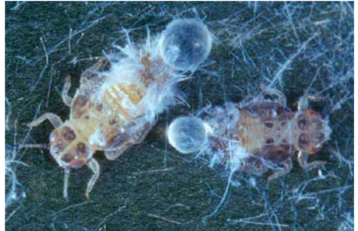
Figure 4. Older nymphs of Boreioglycaspis melaleucae Moore, a psyllid, secreting honeydew. Waxy flocculence has been brushed away.

(Figure 5). Branches and leaves become covered with the waxy filaments creating a flocculence (wool-like tufts) that indicates a heavy infestation (Figure 6). Rain will wash away the flocculence, but nymphs will soon secrete more. In addition, they produce copious amounts of honeydew held externally in balloon-like waxy membranes; nymphs discard honeydew filled spheres nearby. Adults also excrete waxy spheres of honeydew, but they flip them away from their immediate area.