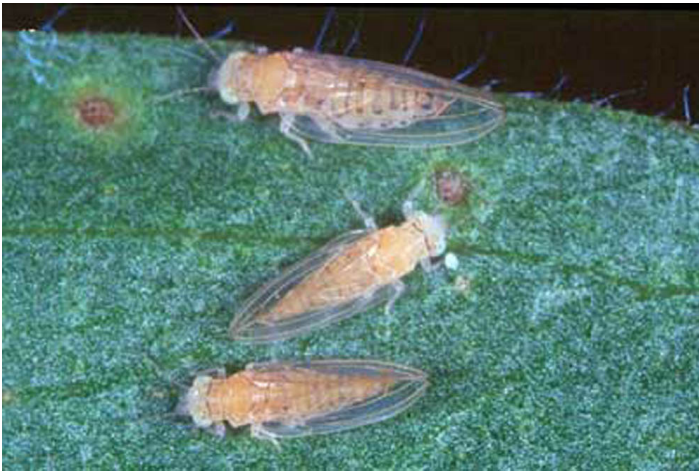
Figure 2. Adults of Boreioglycaspis melaleucae Moore, a psyllid.