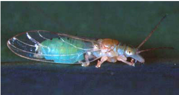
Figure 9. Female green color morph of Glycaspis brimblecombei Moore, a psyllid. Credits: Susan Wineriter, USDA