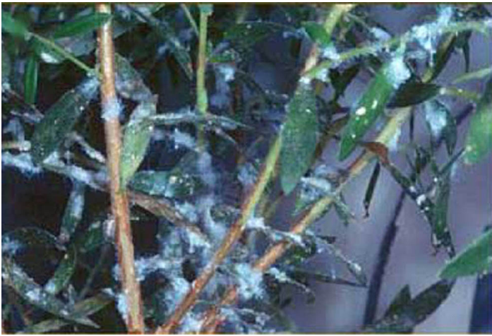
Figure 6. Melaleuca stems and leaves covered with a white waxy flocculence produced by a heavy infestation of nymphs of Boreioglycaspis melaleucae Moore, a psyllid.