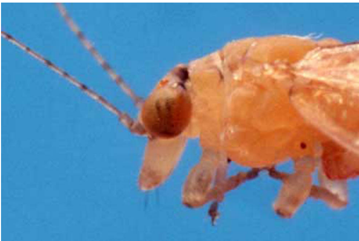
Figure 3. Lateral view of the gena of Boreioglycaspis melaleucae Moore, a psyllid.

Males and females can be distinguished easily from one another by the shape of their abdomens and by the male genitalia. The abdomen of a male is shaped like an elongated isosceles triangle when viewed from above and terminates in distinctive claspers, easily apparent when viewed laterally. The abdomen of a female is more rectangular, gradually tapering to the tip; the pleural membranes usually are expanded, partially visible from above, bulging with eggs. Females generally are larger than males. Adults frequently drag their hind legs when walking, and jump or fly when disturbed.