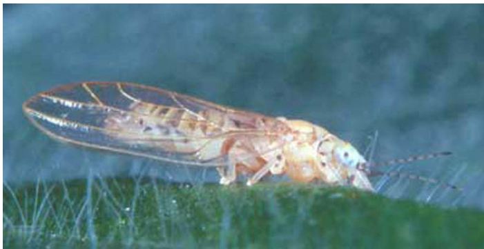
Figure 1. Adults of Boreioglycaspis melaleucae Moore, a psyllid.

The introduced tree Melaleuca quinquenervia (Cav.) S.T. Blake (Myrtaceae), known as paperbark, punktree, or melaleuca, is an aggressive invader of many South Florida ecosystems, including the Everglades. Melaleuca is considered a pest because it displaces native vegetation and degrades wildlife habitat; it also creates fire hazards and can cause human health problems (Rayamajhi et al. 2002). The USDA/ARS with federal and state permission introduced the psyllid Boreioglycaspis melaleucae (Figure 1) into Broward County, Florida, in February 2002 as a potential biocontrol agent of melaleuca.