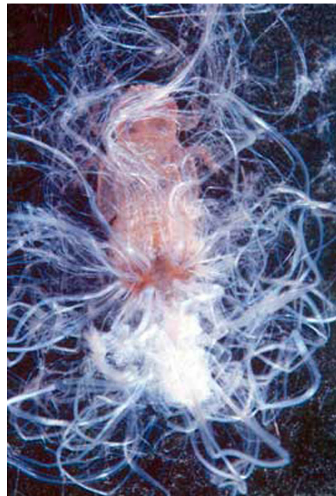
Figure 5. Nymph of Boreioglycaspis melaleucae Moore, a psyllid, exuding filamentous wax strands.