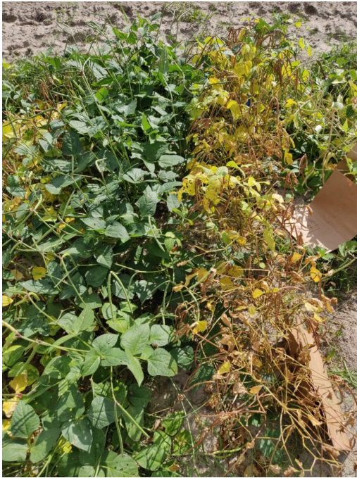
Figure 3. Differential cultivar performance for biotic stresses in Florida. Healthy cowpea cultivar (left) grown next to a pest- and disease-susceptible cultivar (right).