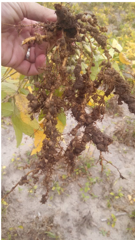
Figure 4. Severe root galling from root-knot nematode on soybean. Galls are irregularly shaped swellings of the root. This distinguishes them from nodules, which are regular, rounded, and easily detached from the root.