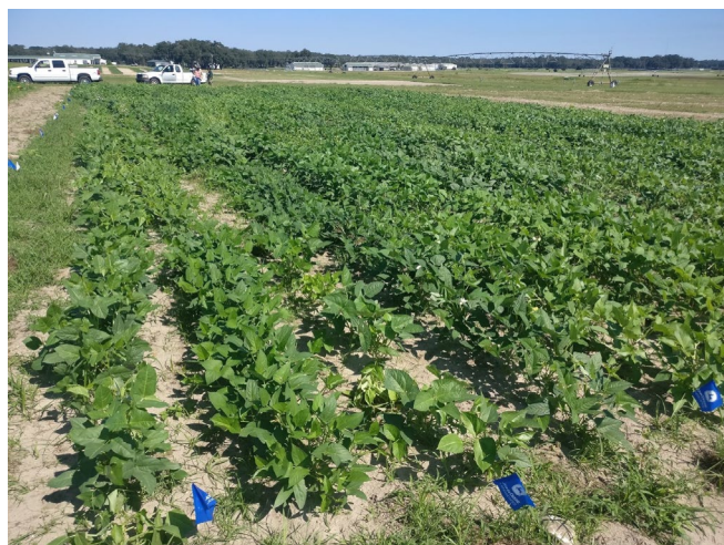
Figure 1. Cowpea breeding trial at the University of Florida.

Cover crops are grown between cash crop cycles, or intercropped with cash crops to cover the ground, such as in vegetable fields, orchards, groves, and agricultural sites. If used appropriately, cover crops can improve soil structure and fertility, decrease soil erosion, provide foliage and animal feed, and suppress crop pests such as weeds, insects, nematodes, and other plant pathogens. Residues from cover crops can be incorporated as green manure to supply nutrients and improve fertility for the next crop. Using cover crops can increase on-farm crop diversity, may enhance many beneficial organisms, and could possibly even contribute to carbon sequestration. One good example of a summer cover crop is cowpea, Vigna unguiculata (L.) Walp, due to its fast establishment, abiotic and biotic stress tolerance, and biomass production (Figure 1).