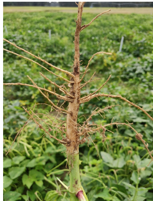
Figure 2. Cowpea root system showing large, round nodules that are fixing nitrogen.

Cowpea is one of the most tolerant legumes to high temperature and drought, and it can be a significant contributor to sustainable cropping systems. Therefore, it is well-adapted to Florida's hot and humid climate as well as sandy soils. For more information on cover crop production in Florida, see Seepaul et al. (2023). One advantage of using cowpea as a cover crop is its ability to associate with nitrogen-fixing bacteria and thus provide nitrogen for itself and the following crop (Figure 2). Besides fixing nitrogen, cowpea provides other ecosystem services such as weed and nematode suppression, but not all cowpea cultivars perform the same. Some cowpea cultivars can be damaged by several pests and diseases (Figure 3), including root-knot nematodes ( Meloidogyne spp.), the key nematode pest in many cropping systems in north central Florida (Harrison et al. 2014; Dareus et al. 2021). Using susceptible cultivars as cover crops could result in severe root galling (Figure 4). When nematodes build up on cowpea or other cover crops, they can cause damage and yield loss to the next crop planted, which could be a valuable cash crop.