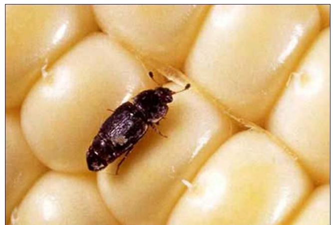
Figure 2. Adult Carpophilus lugubris Murray, the dusky sap beetle.