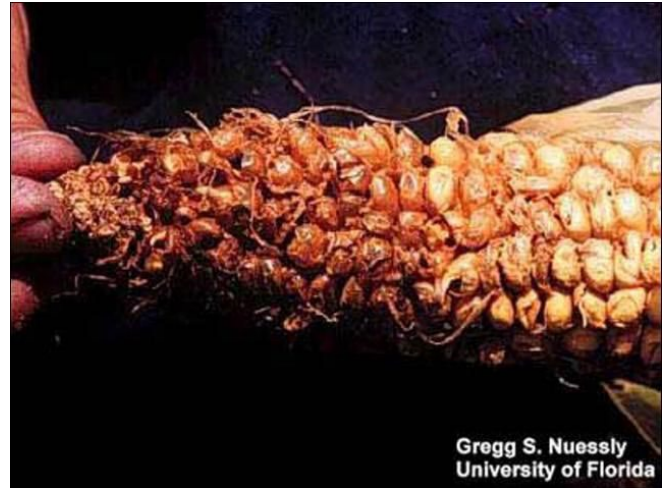
Figure 13. Sap beetle ( Carpophilus spp.) larval and adult damage to entire sweet corn ear.

sap beetle attacks ripe, nearly ripe, or decaying strawberry fruit by boring into the berry and devouring a portion in the field. In the Florida study (Potter 1995) Epuraea luteolus apparently feeds on decomposing fruit material. The study, however, did not demonstrate the economic impact, if any, on strawberry fruit production. The presence of Epuraea luteolus on strawberry fruit may be more of an issue of contamination by beetles and possibly larvae.