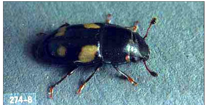
Figure 1. Adult Glischrochilus quadrisignatus (Say), a picnic beetle.

Although there are many species of sap beetles, only several species are known agricultural pests of field and stored products. These include the dusky sap beetle Carpophilus lugubris Murray on field and sweet corn; the corn sap beetle, Carpophilus dimidiatus on field corn; the complex Carpophilus dimidiatus (F.), Carpophilus freemani Dobson, and Carpophilus mutilatus Erichson on stored maize (Arbogast and Throne 1997); the dried fruit beetle Carpophilus hemipterus (L.); the pineapple beetle, Urophorus humeralis ; a picnic beetle, Glischrochilus quadrisignatus (Say); the strawberry sap beetle, Stelidota geminata (Say); and the yellowbrown sap beetle, Epuraea (Haptoncus) luteolus (Erichson), a pest of dried fruit. Sap beetles are often considered minor pests but the presence of large numbers of sap beetles on a host plant can prove economic in terms of crop damage caused by the feeding beetles; however, impact on crop value is primarily due to the contamination of products ready for sale by adults and larvae. In addition to damage caused by feeding, sap beetles have also been recognized as vectors of fungi (Dowd 1991).