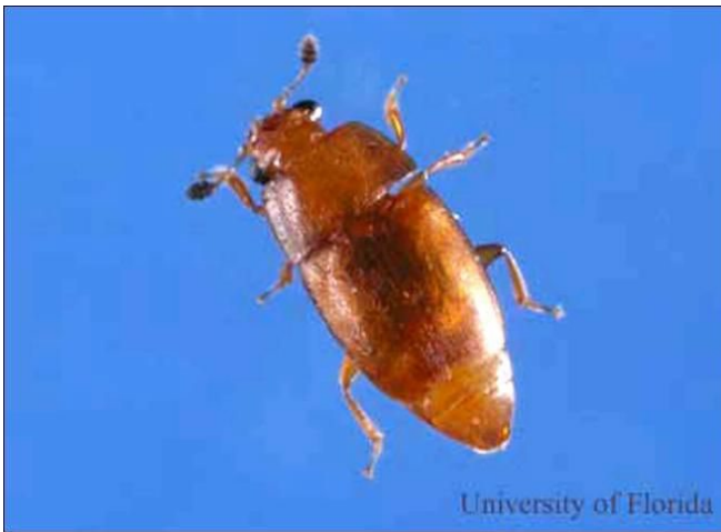
Figure 3. A yellowbrown sap beetle, Epuraea luteolus (Erichson), collected on strawberry.