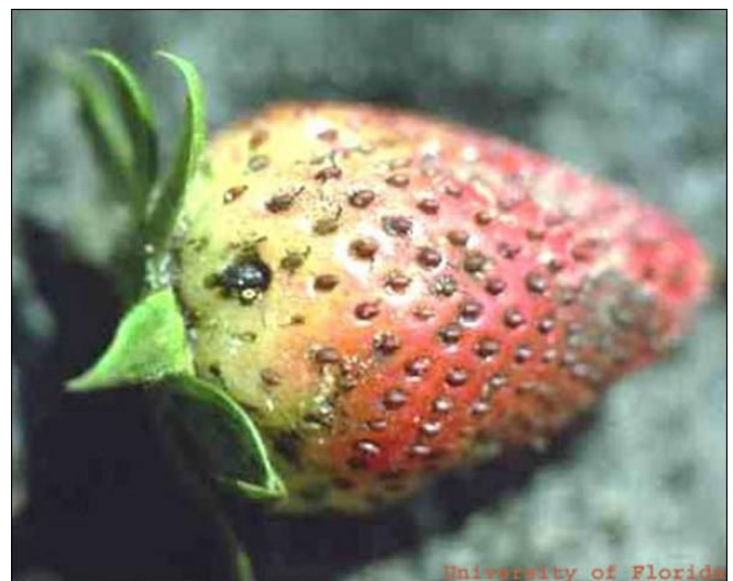
Figure 14. Sap beetle feeding on strawberry.