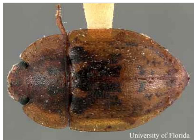
Figure 11. Pinned adult Lobiopa insularis (Cast.), collected on strawberry.