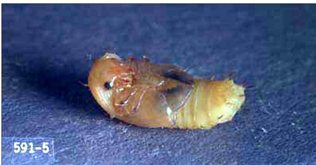
Figure 7. Pupa of Carpophilus lugubris Murray, the dusky sap beetle.

Pupae are white, turning cream colored and later tan before adult emergence. The pupa is typical exarate (furrowed) averaging 4.4 mm (~3/16 in) in length and 2.0 mm (~1/16 in) in width (Parsons 1943).