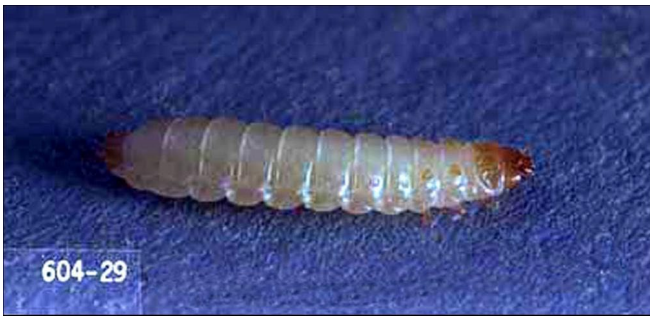
Figure 6. Larva of Carpophilus lugubris Murray, the dusky sap beetle.