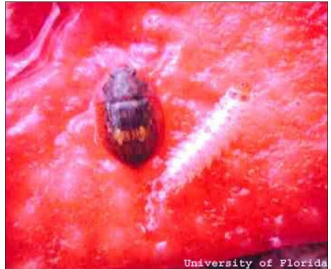
Figure 10. Adult (left) and larva (right) of the large sap beetle (picnic beetle, nitidulid) Lobiopa insularis.