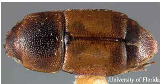
Figure 4. Adult Carpophilus fumatus Boheman, collected on strawberry.