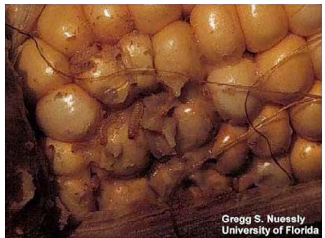
Figure 9. Sap beetle ( Carpophilus spp.) larvae feeding at base of sweet corn ear. Note legs and light brown head on larvae as opposed to the maggot shape of cornsilk fly larvae (next figure). EENY-224: Cornsilk Fly (suggested common name), Euxesta stigmatias Loew (Insecta: Diptera: Otitidae).