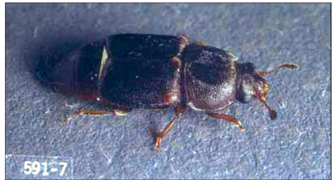
Figure 5. Adult Carpophilus lugubris Murray, the dusky sap beetle.

The dusky sap beetle adult, Carpophilus lugubris , is about 2.8 mm (~1/8 in) long with short elytra. The adult is uniform dull black in color.